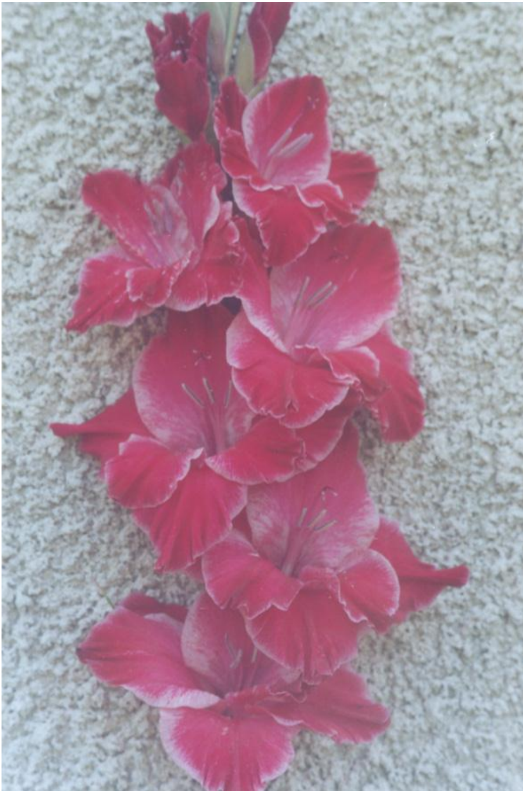
11. 465 "Vashe Blagorodye". Murin. Medium. Brand-new. Is distinguished by original colour, big flower