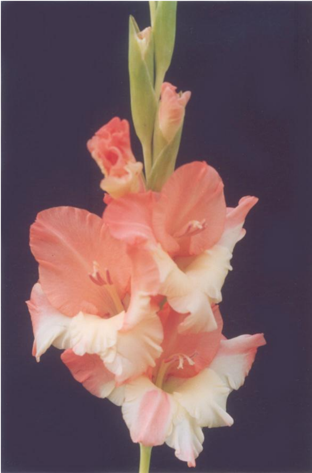
102. 445 "Nejnoye Sozdanye". Murin. Medium. Brand-new. Is distinguished by very gentle rosy colour and purely white very big spot emphasizing this colour