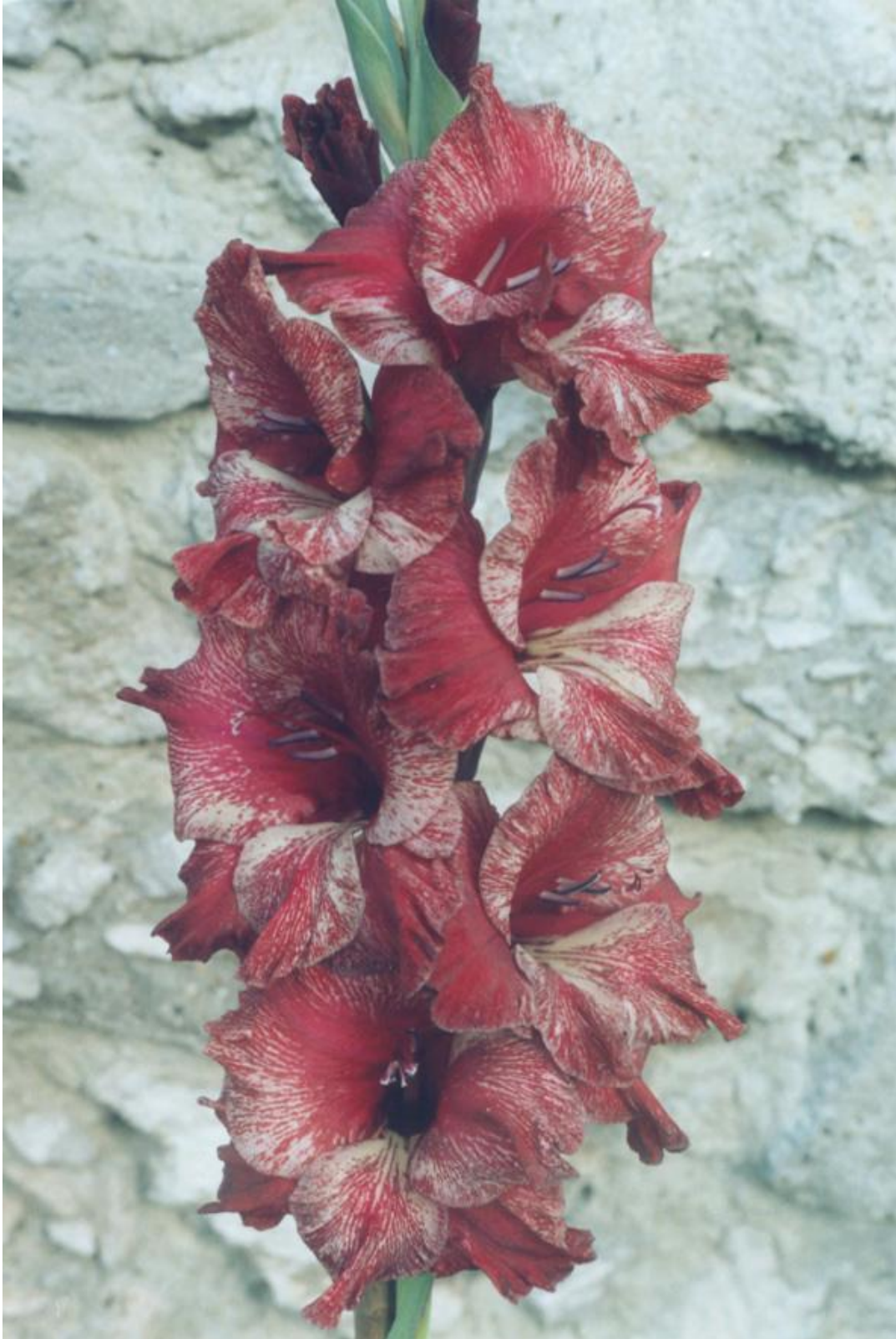
91. 597 "Sultan". Murin. Medium. Brand-new. Is distinguished by moire pattern mainly on inner petals and brown-red colour, very big flowers up to 16 cm