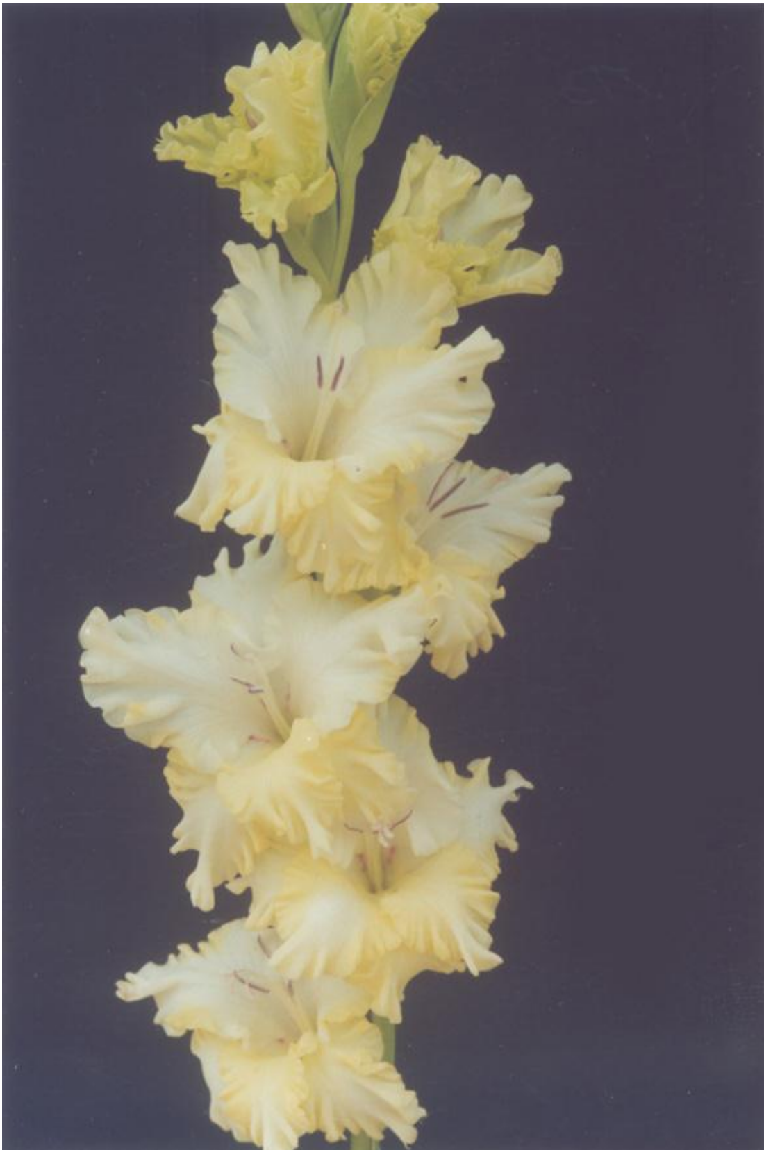
23. 513 "Zlatye Gory". Murin. Medium. Brand-new. Beautiful kilting, very dense texture of petals, original colour