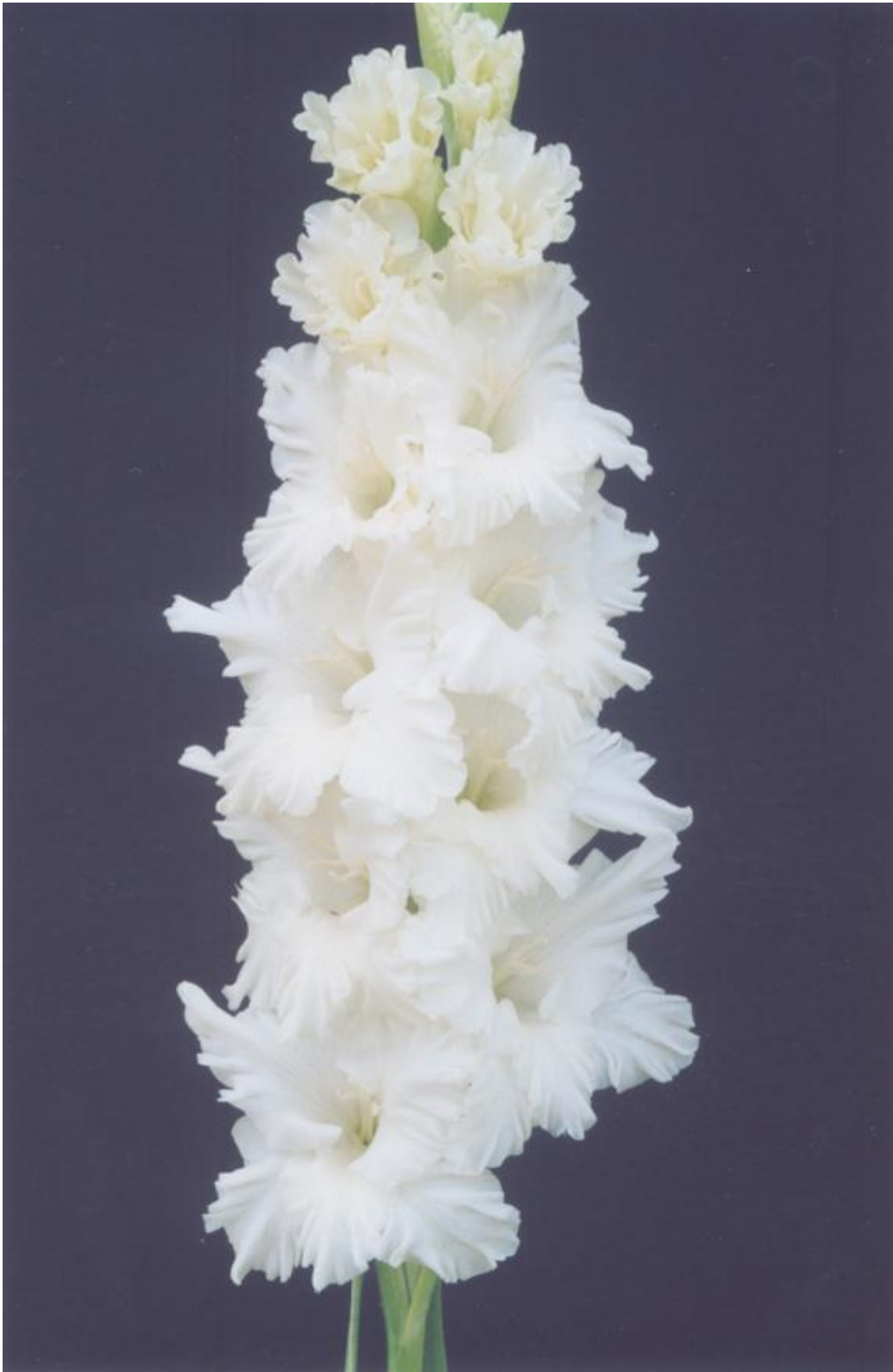
50. 500 "Sniejnaya Dolina". Murin. Medium. Brand-new. Flowers up to 14 flowers, beautiful thick ear, nice kilting, flower is 15 cm in diameter