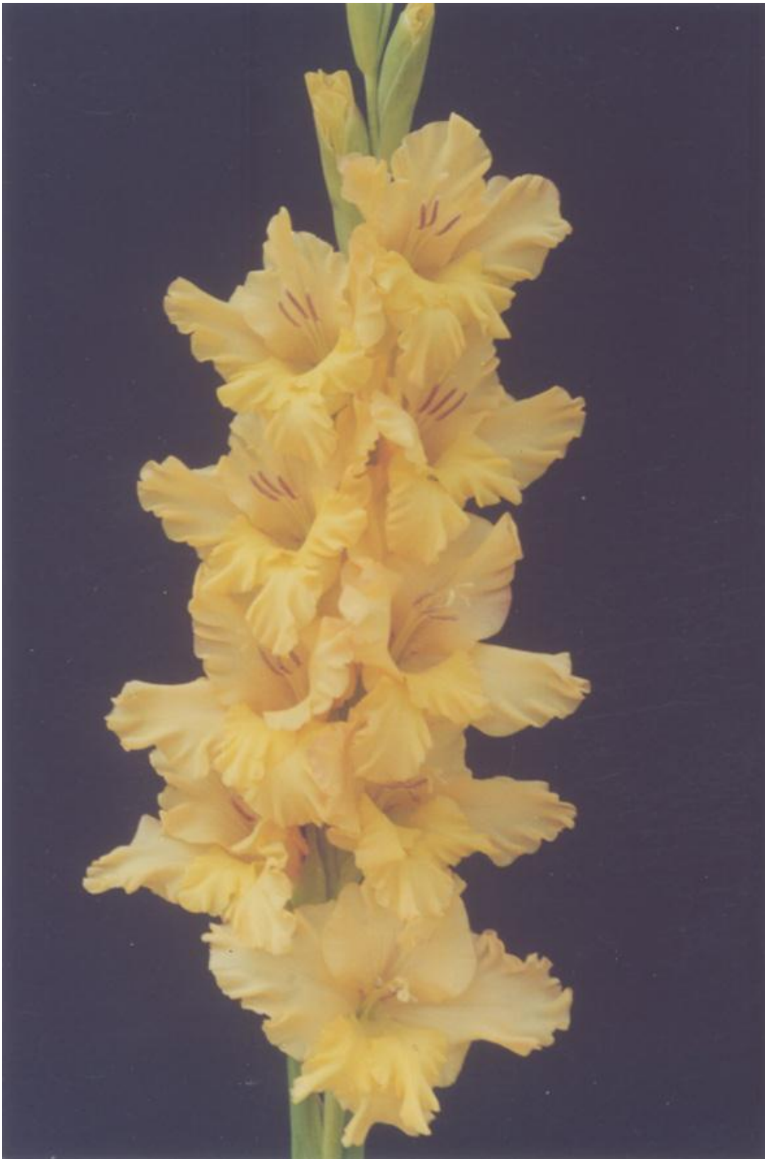
24. 516 "Zolotoy Oryol". Murin. Medium. Brand-new. Is distinguished by dark yellow colour, good growth