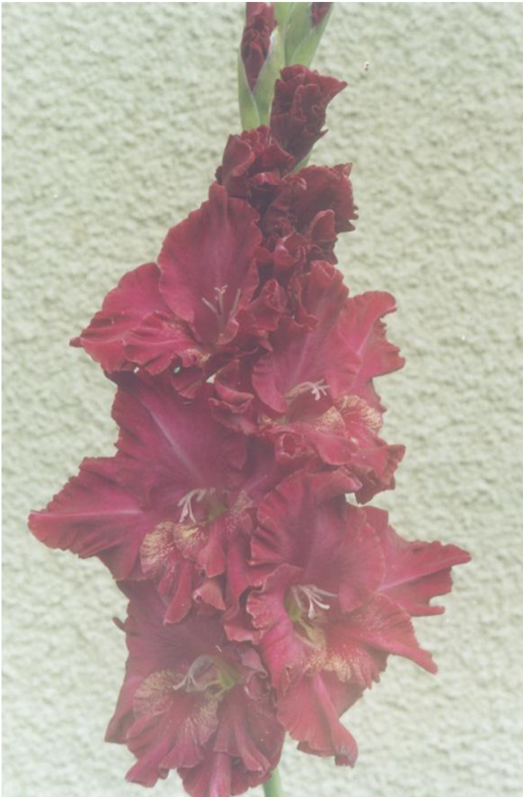
26. 579 "Antikvariat". Murin. Medium. Brand-new. Golden moire spot gives antiquarian look, very big flower of up to 17 cm in diameter