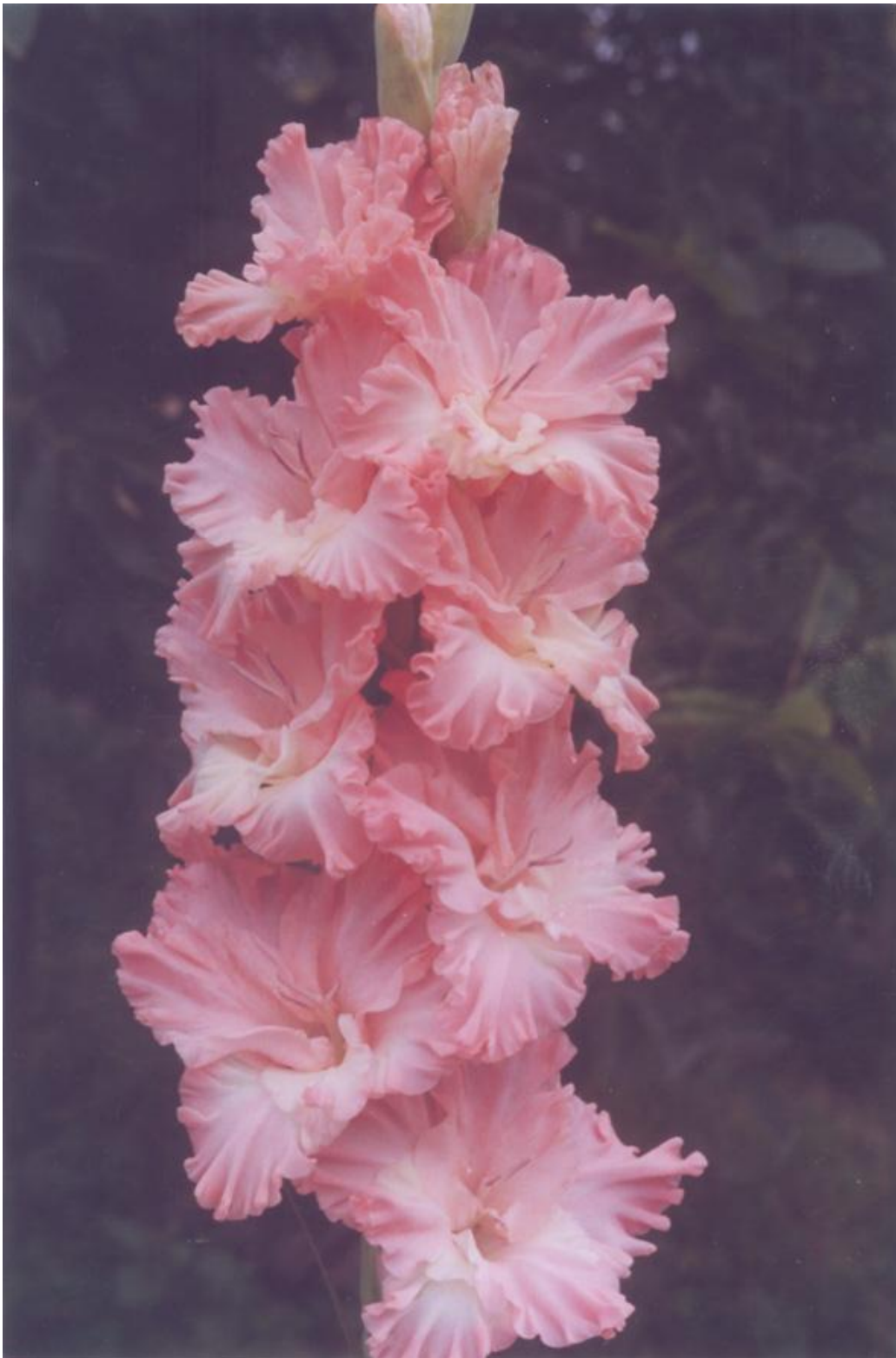
5. 544 "Miledi". Murin. Medium. Brand-new. Is distinguished by very dense texture of petals and beautiful kilting, strong