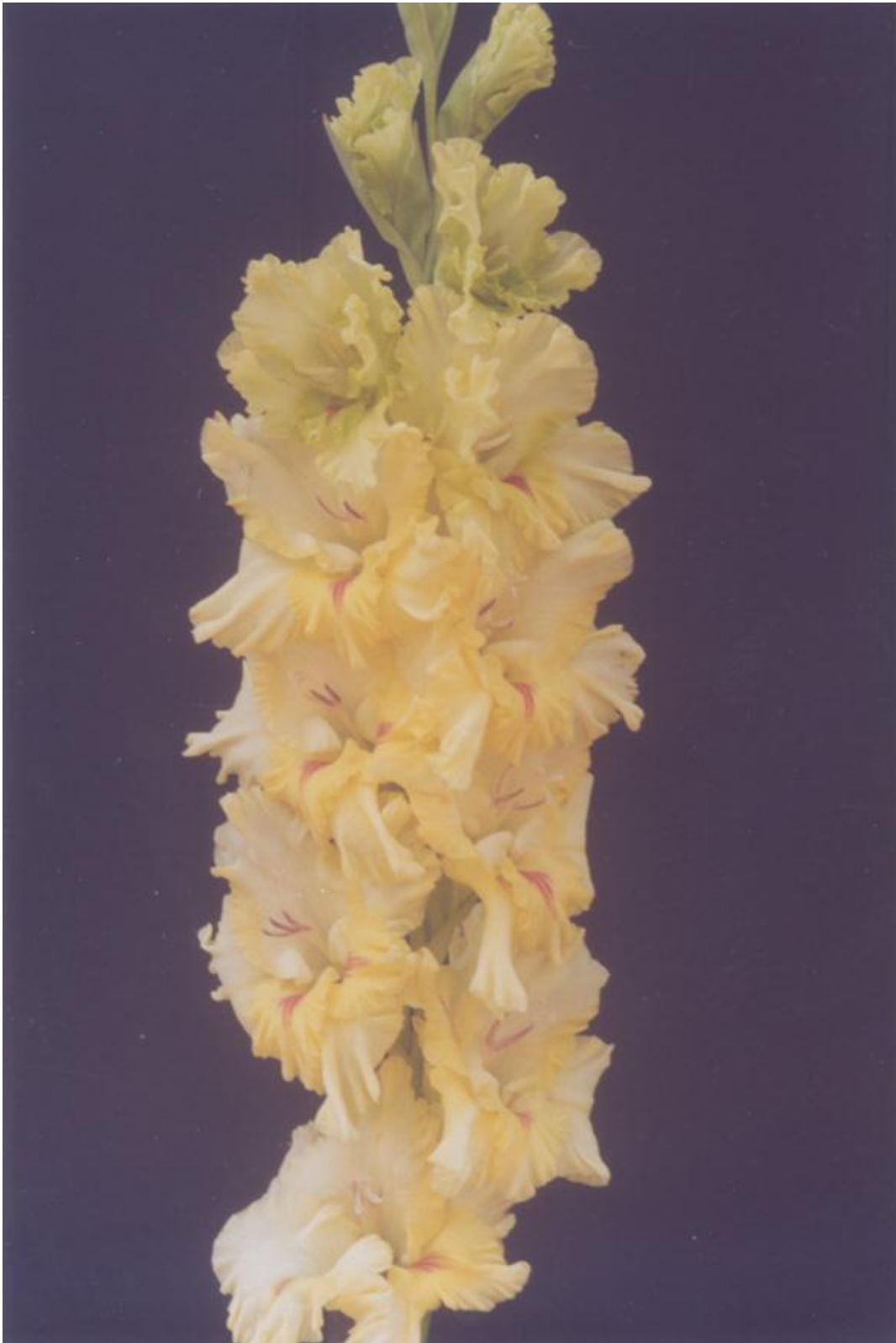
34. 515 "Luny Lik". Murin. Medium. Brand-new. Flowers up to 12 flowers, beautiful kilting, dense texture