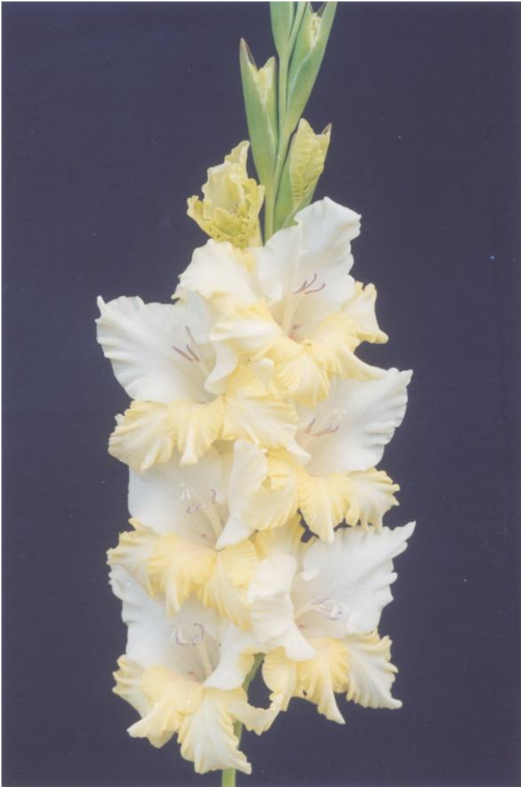
52. 501 "Sharman". Murin. Medium. Brand-new. Is distinguished by beautiful large point on white background