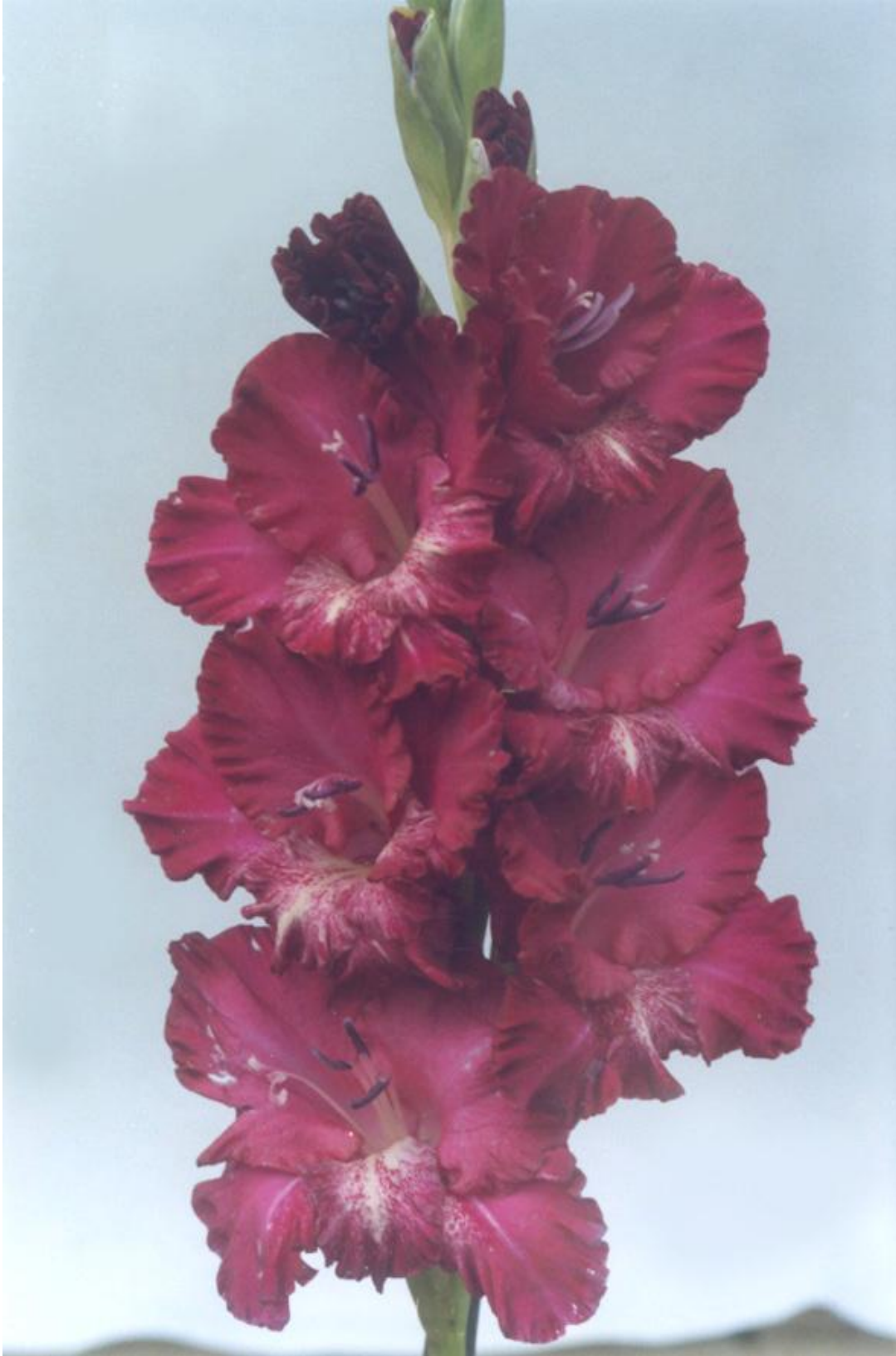
98. 479 "Ritm". Murin. Medium. Brand-new. Purple, big flower, moire spot emphasizes original colour