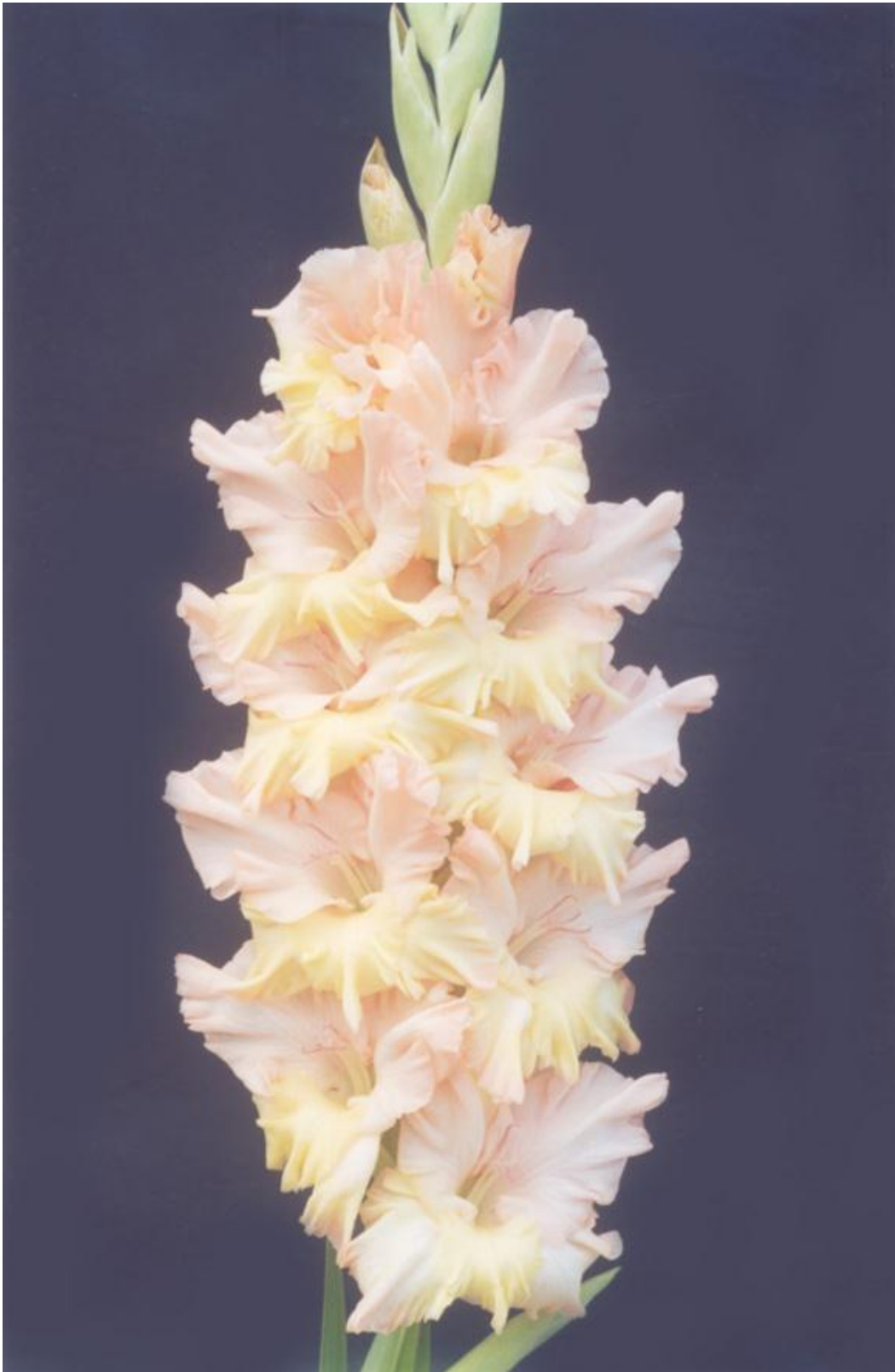
55. 541 "Printsesa Tsyрка". Murin. Medium. Brand-new. Rosy-pale with large yellow-pale spot, flowers up to 12 big flowers, beautiful ear