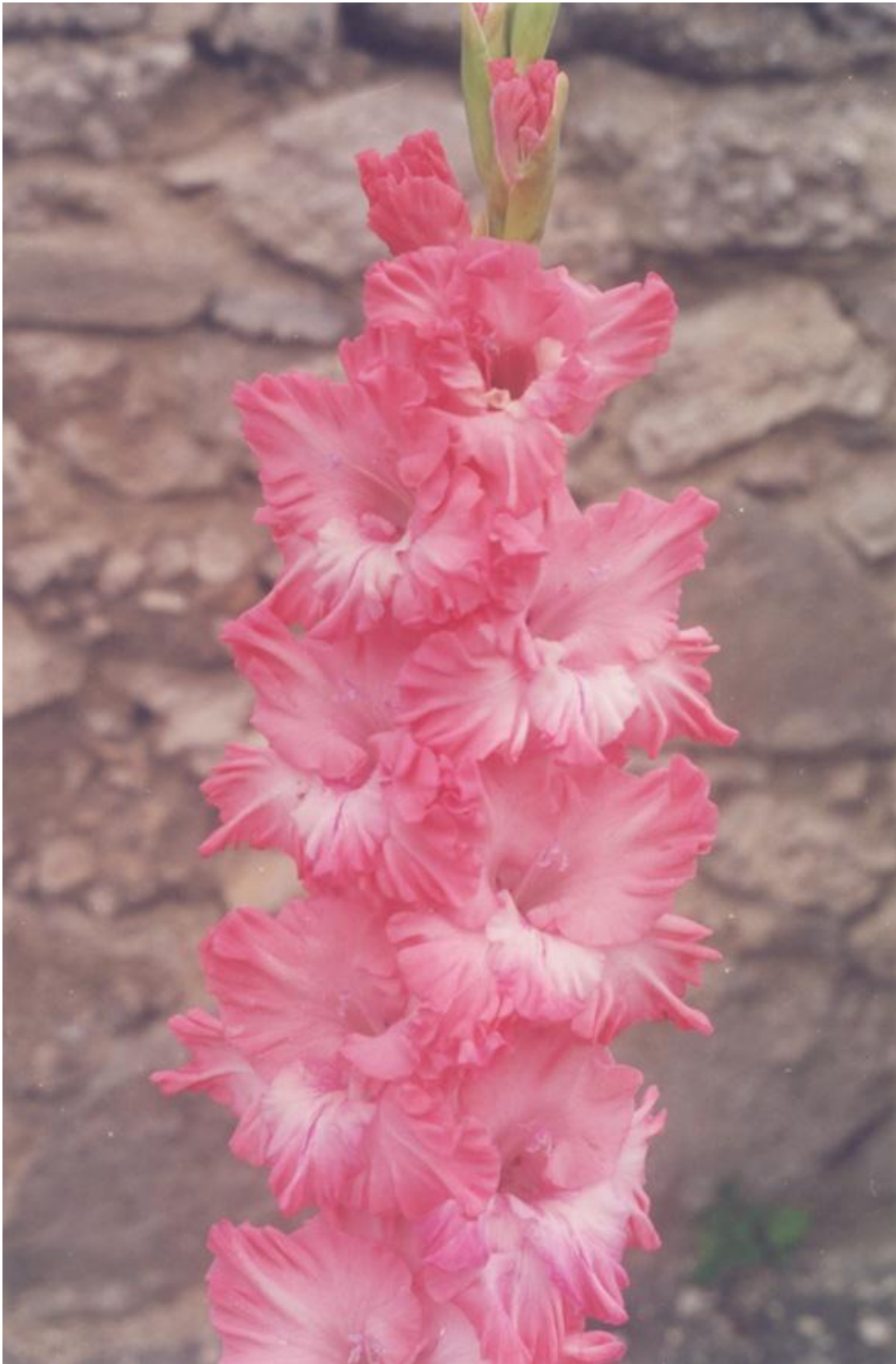
48. 545 "Unikum". Murin. Medium. Brand-new. Is distinguished by original rosy colour, beautiful kilting, dense texture