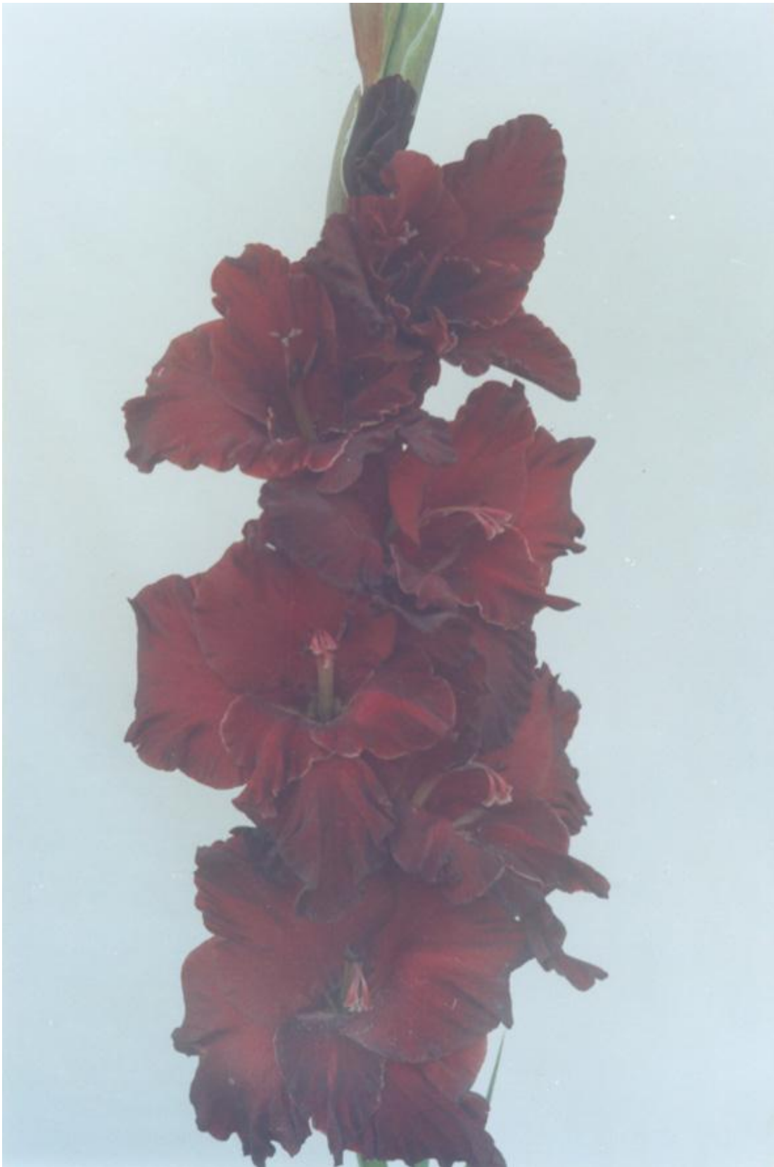
20. 558 "Etna". Murin. Medium. Brand-new. Is distinguished by black and red colour with petals' black edges