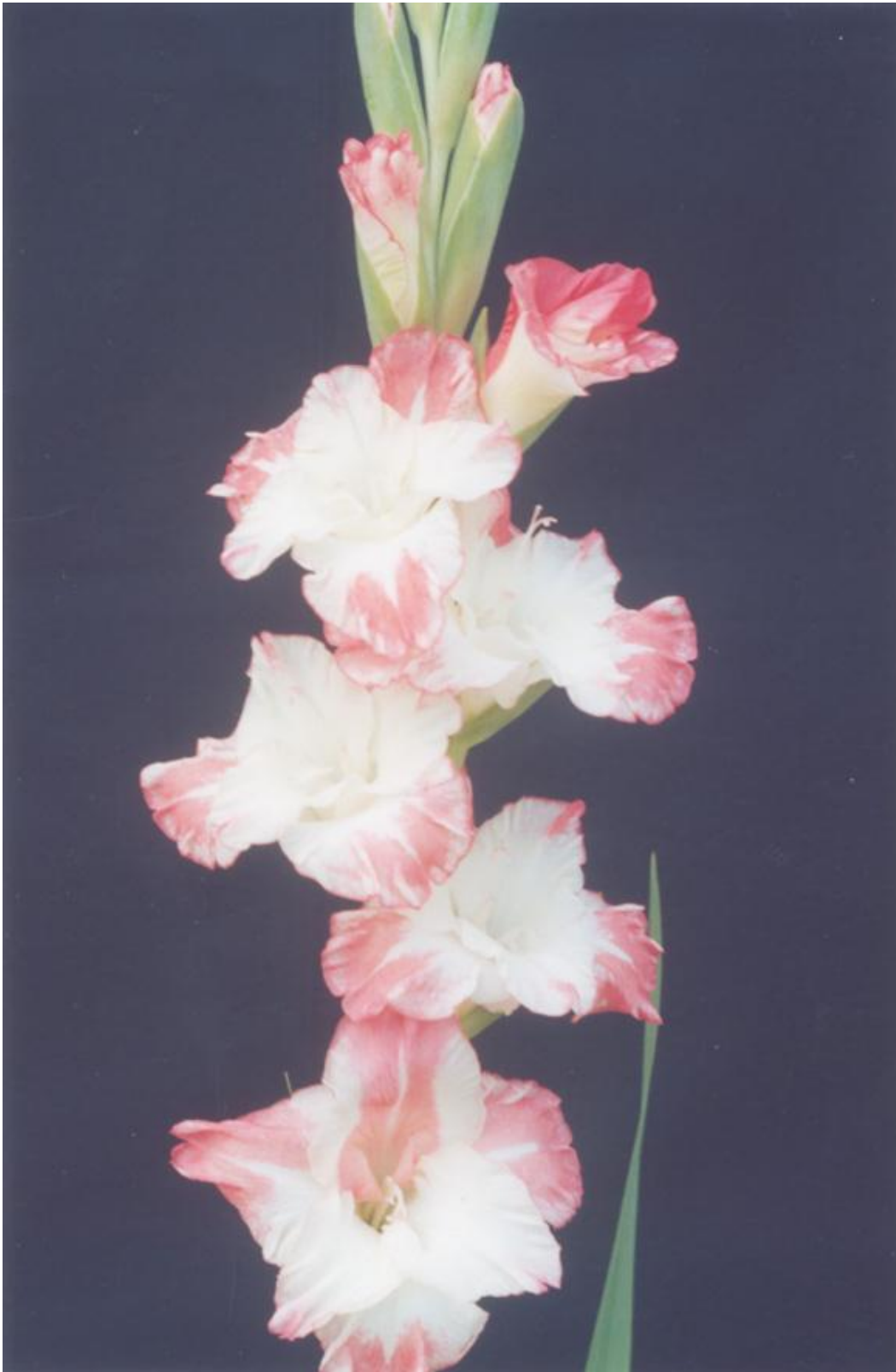
54. 445 "Madlen". Murin. Medium. Brand-new. Is distinguished by very large white spot, nice match of white and rosy