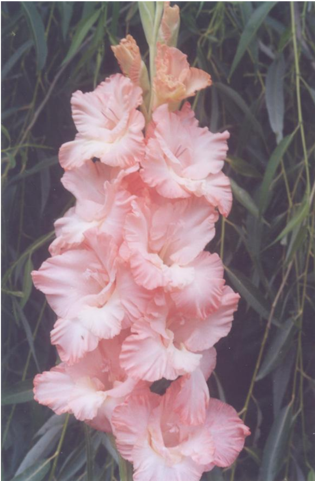
10. 543 "Riorita". Murin. Medium. Brand-new. Is distinguished by big flowers and intense growth