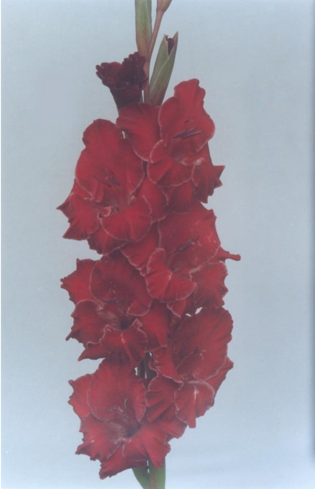
99. 559 "Chyarodey". Murin. Medium. Brand-new. Nice black-red colour of the flower with silver edging, thick ear, dense texture