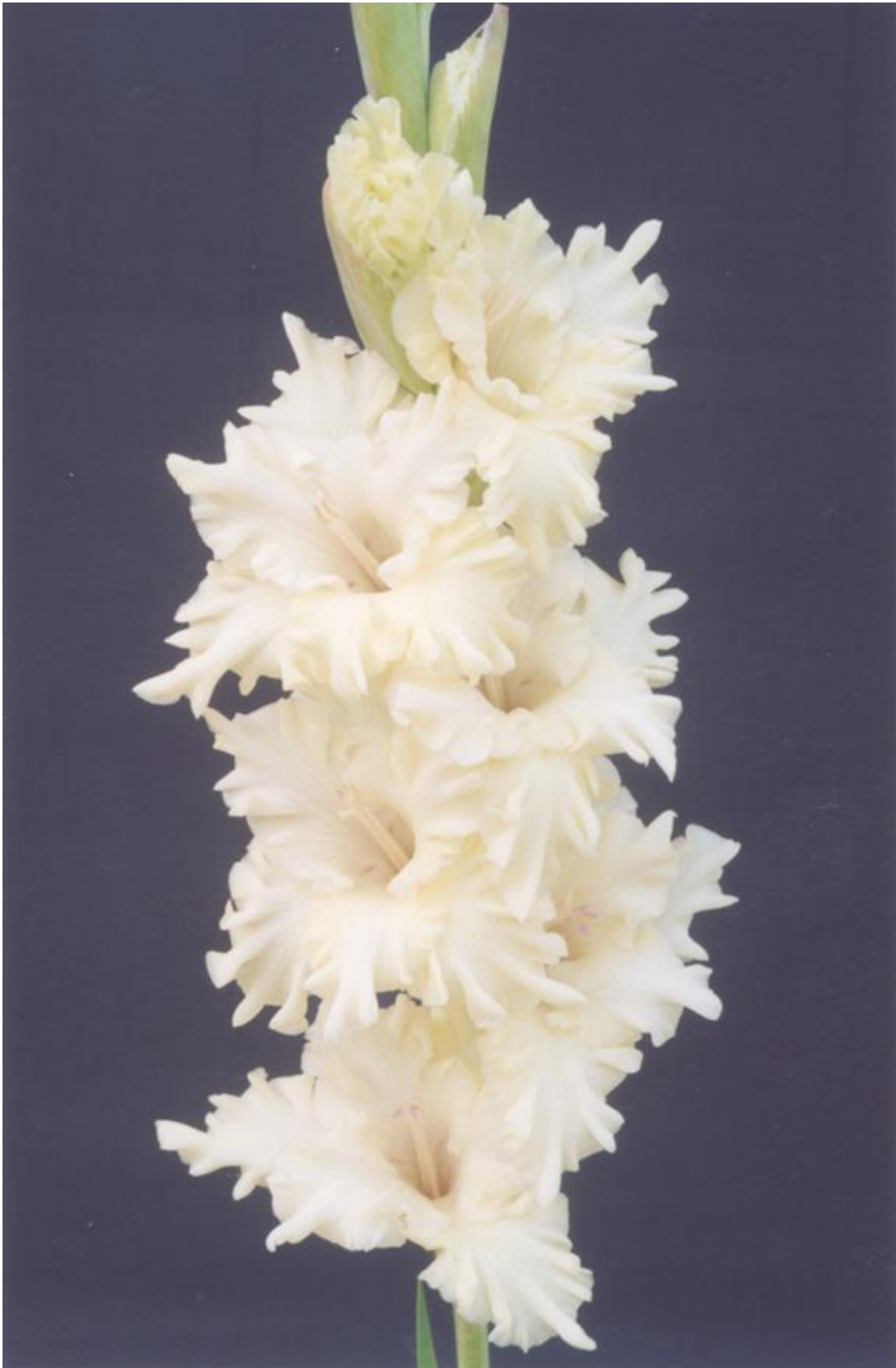
58. 410 "Diferamb". Murin. Medium. Brand-new. Very beautiful kilting, nice cream colour