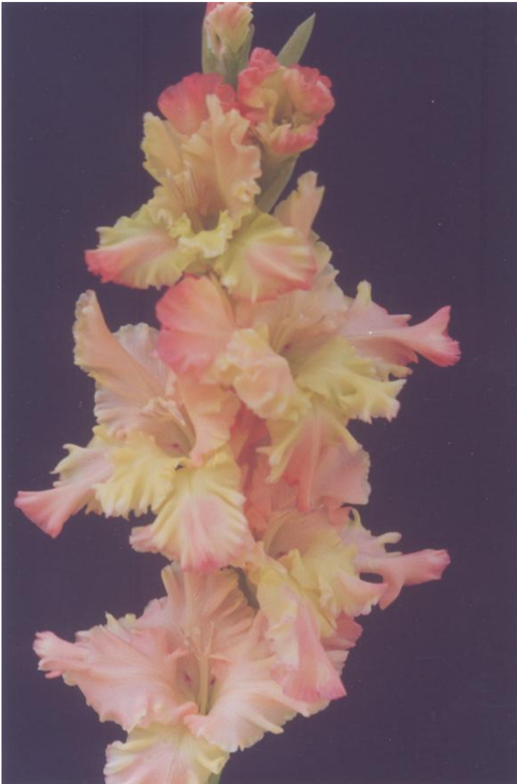
31. 545 "Garmonya". Murin. Medium. Brand-new. Is distinguished by large yellow-green spot, beautiful killing and very dense texture of petals