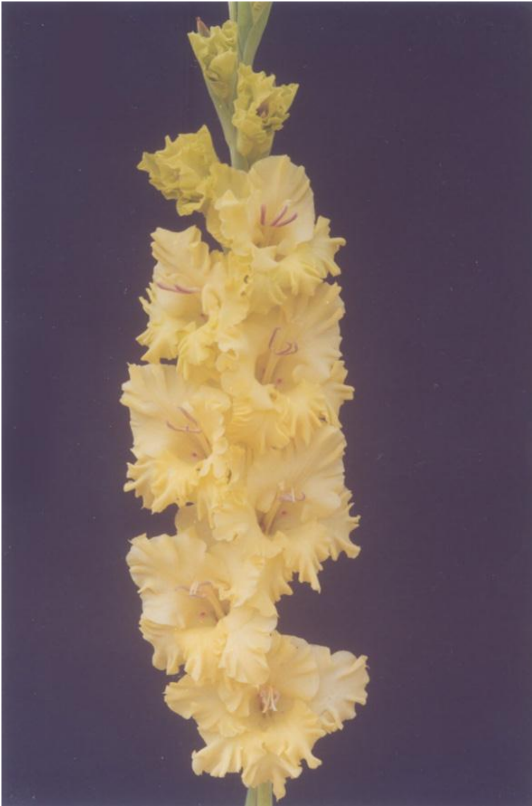
35. 414 "Lunaya Rapsodya". Murin. Medium. Brand-new. Is distinguished by beautiful inflorescence, nice kilting, dense texture and colour