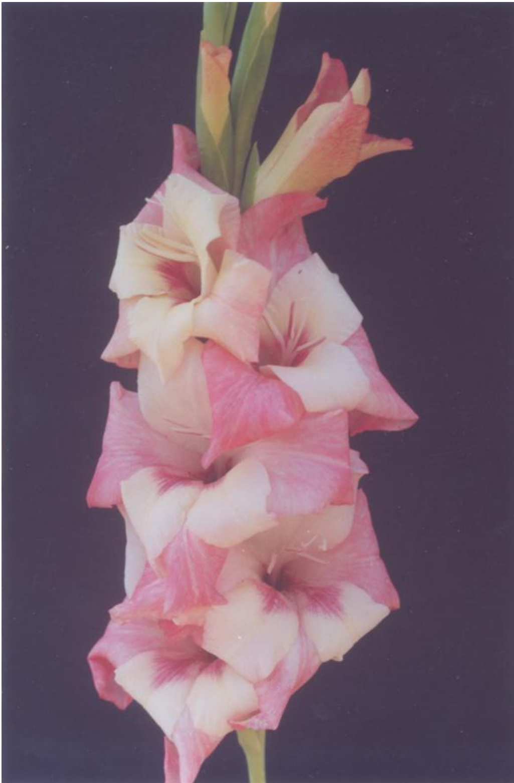
1. 445 "Santa Fe". Murin. Medium. Brand-new. Aromatic, disease-resistant, bicolor, big flower