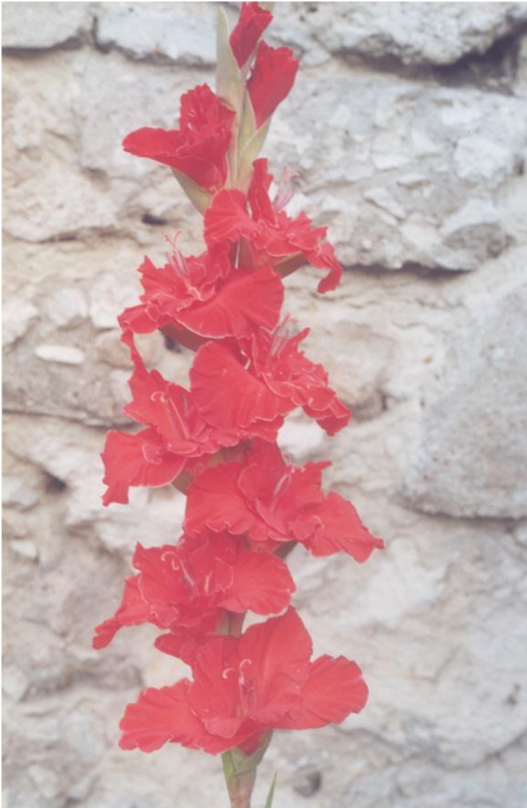
60. 454 "Krasny Kandelyabr". Murin. Medium. Brand-new. Belongs to group "Candelabrum", upward looking flowers are very beautifully arranged