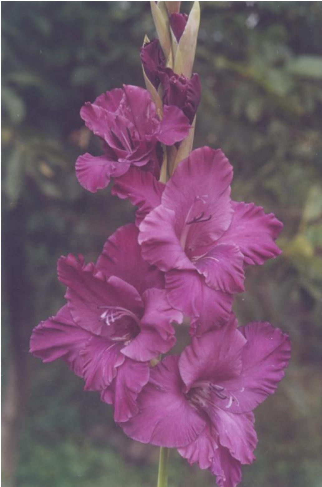
7. 586 "Sim Sim". Murin. Medium. Brand-new. Is distinguished by original violet colour, flowers have 16 cm in diameter