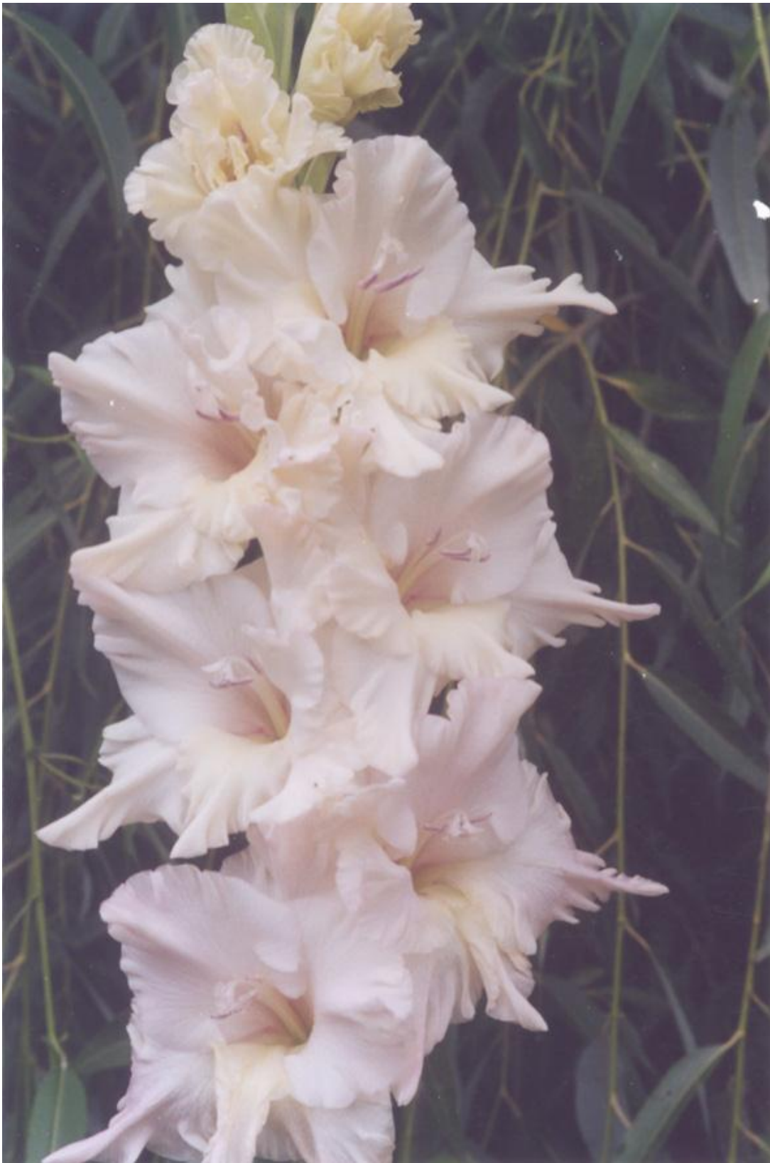
16. 500 "Vodevili". Murin. Medium. Brand-new. Very big flower, strong