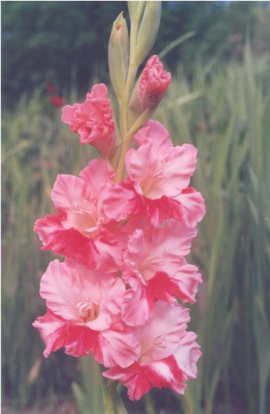
49. 543 "Shou". Murin. Medium. Brand-new. Nice match of red and rosy, dense texture, beautiful kilting