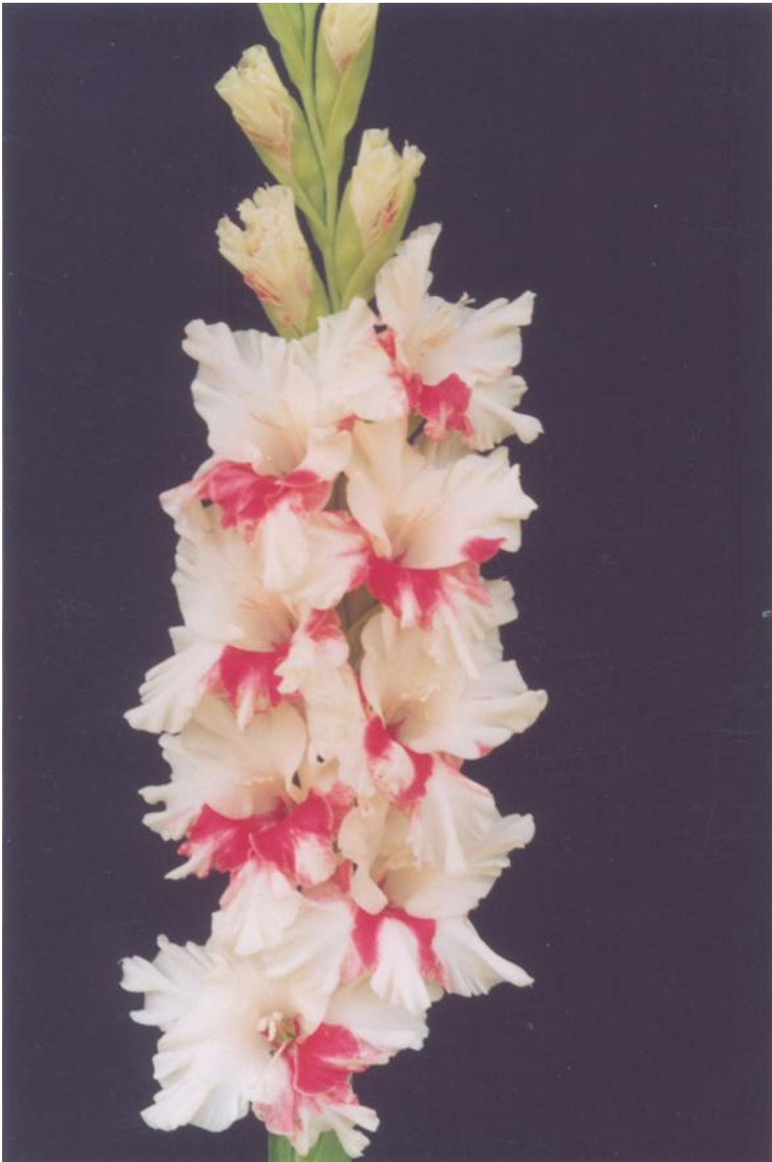
30. 501 "Kulon". Murin. Medium. Brand-new. Is distinguished by large red spot of white superkilted sort, flower of 16 cm in diameter