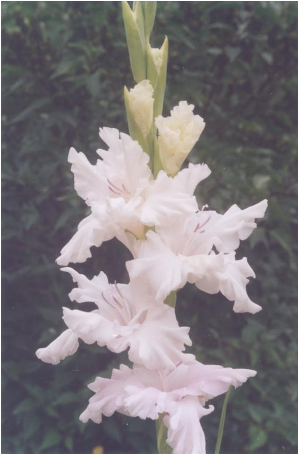
14. 500 "Hrustaliny Kubok". Murin. Medium. Brand-new. Is distinguished by upward flowers, dense texture, beautiful kilting, candellated