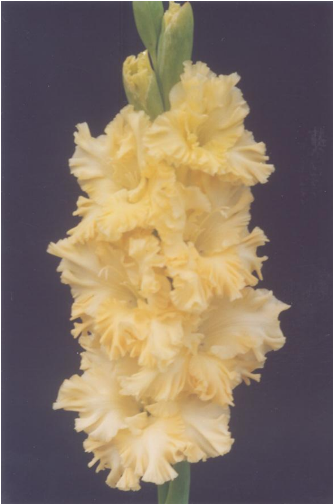
17. 516 "Zolotaya Rossypi". Murin. Medium. Brand-new. Is distinguished by very dense texture of petals, very kilted, beautiful colour