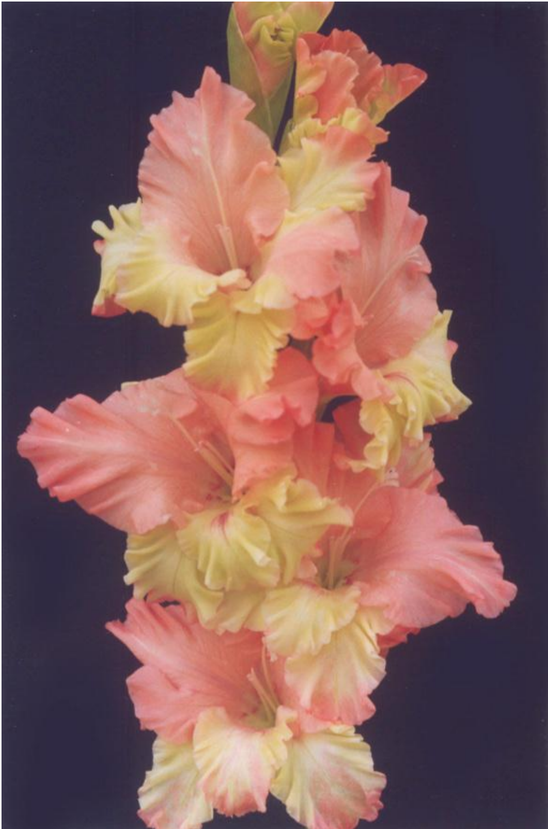
103. 445 "Liubimets Bogov". Murin. Medium. Brand-new. Original salmon-rosy (Pinc) colour of the flower well matches light-green spot