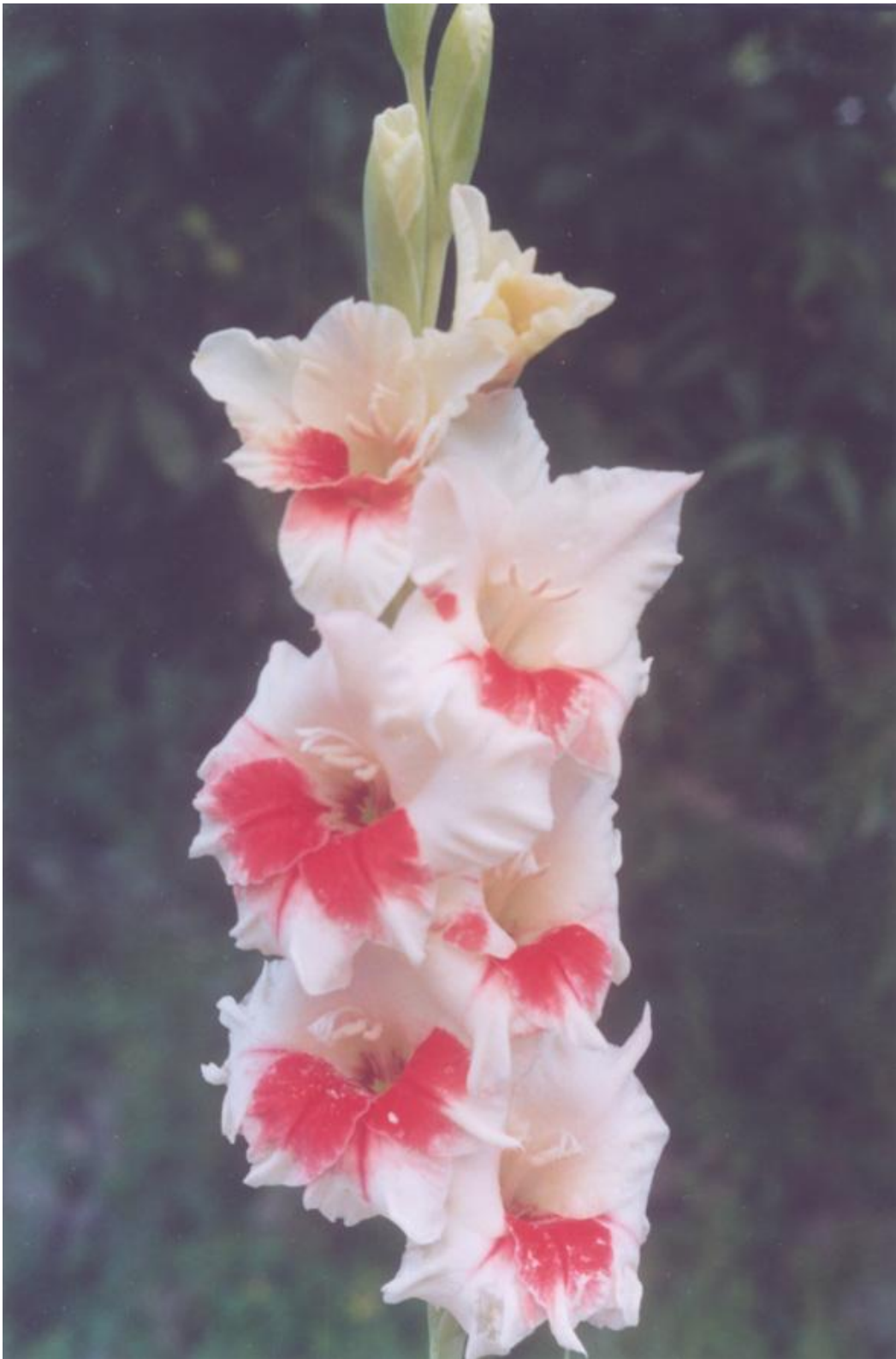
3. 401 "Madam Boterflyai". Murin. Medium. Brand-new. Is distinguished by large red spot, big flower