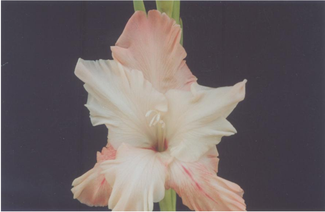
28. 543 "Svezhesti". Murin. Medium. Brand-new. Original bicolour, inner parts are white, outer – rosy, big flower of 16 cm in diameter