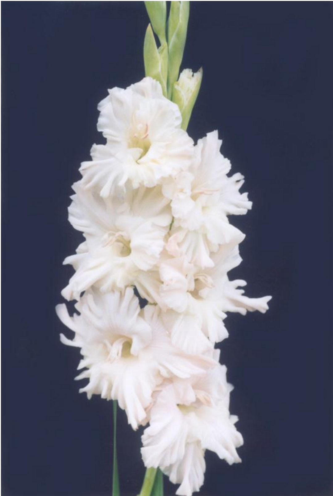
92. 500 "Balet". Murin. Medium. Brand-new. Is distinguished by original kilting, purely white with very dense texture