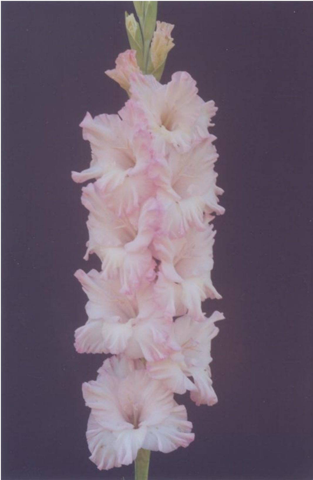
33. 501 "Mazurka". Murin. Medium. Brand-new. Is distinguished by lilac-rosy petals' edges, dense texture, big flower