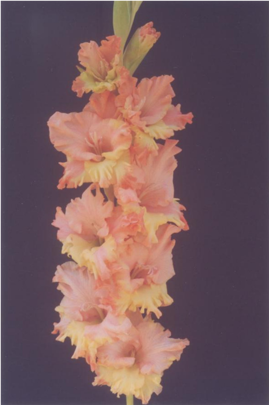
36. 543 "Elita". Murin. Medium. Brand-new. Good structure of flower ear, successful harmonious colour, big flower