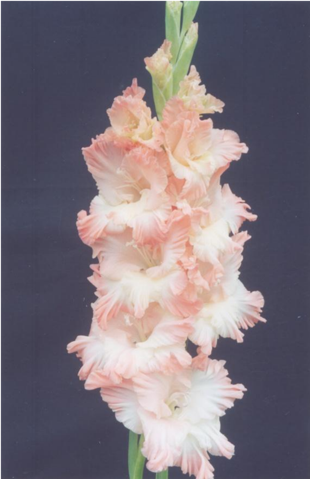
53. 501 "Galateya". Murin. Medium. Brand-new. Is distinguished by accurate rosy edges of petals of white sort