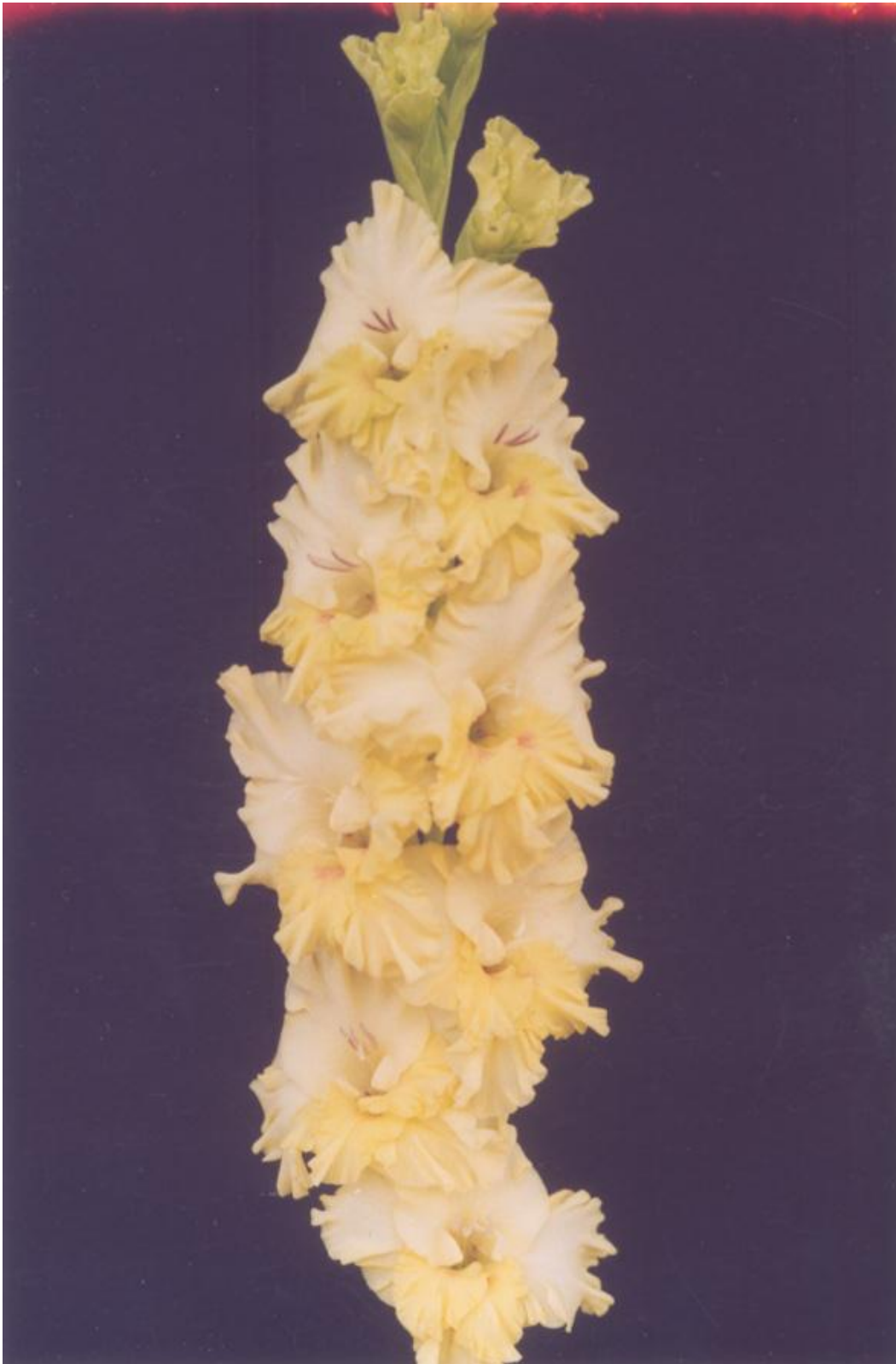
43. "513 Leda". Murin. Medium. Brand-new. Is distinguished by big yellow spot, dense texture and beautiful inflorescence