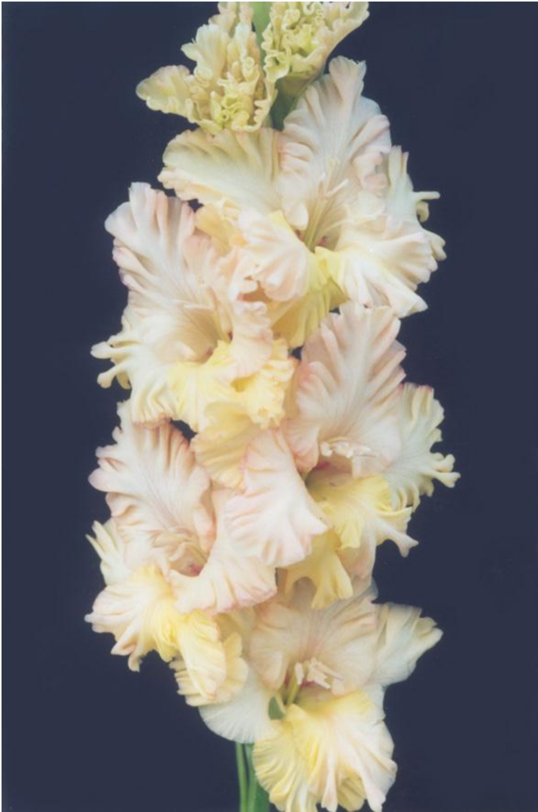
93. 541 "Pryatnii Siurpriz". Murin. Medium. Brand-new. Is distinguished by nice match of rosy-pale and cream colour tones, very kilted, very dense texture