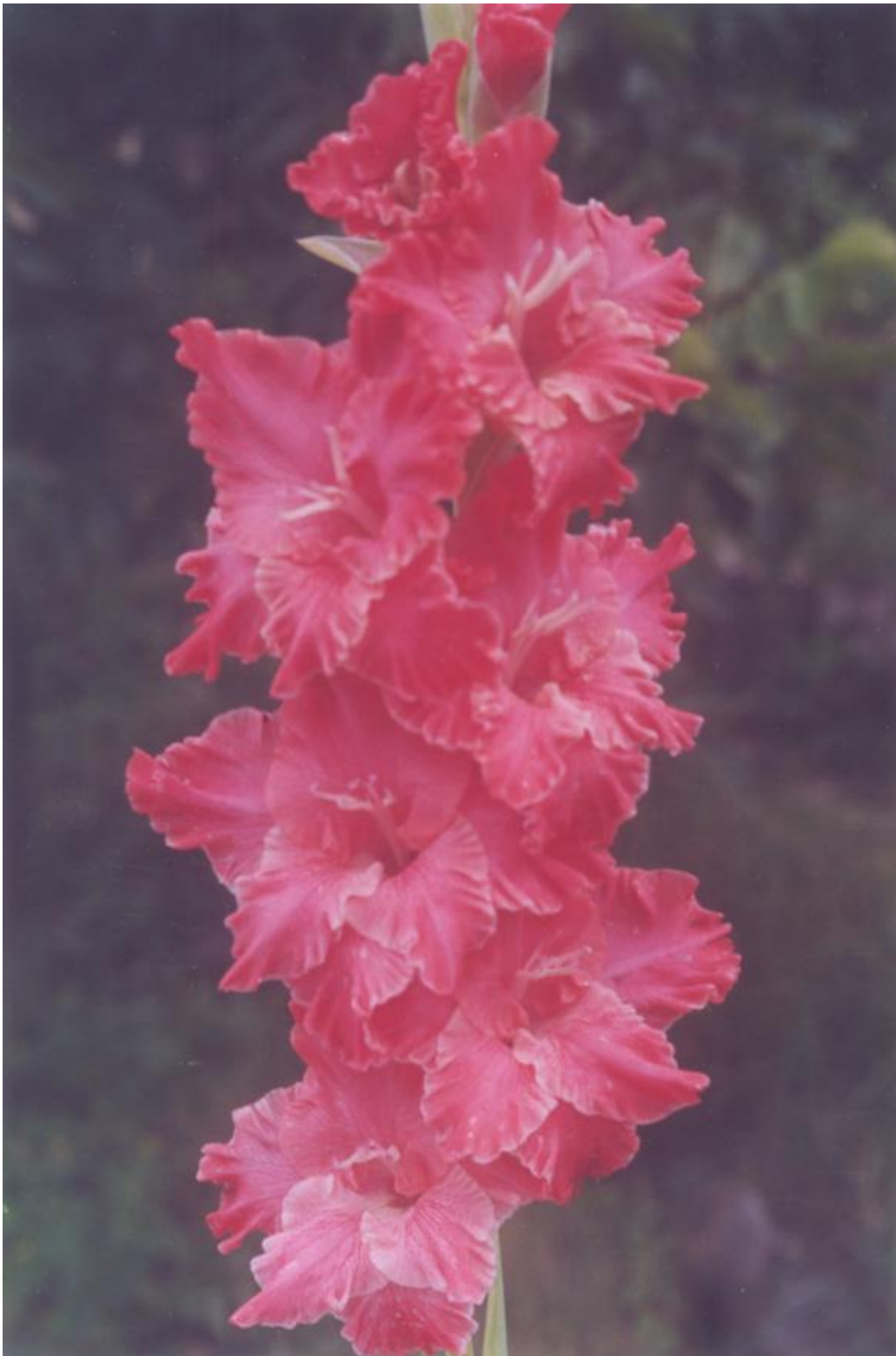
8. 445 "Serebristy Pink". Murin. Medium. Brand-new. Is distinguished by original silver colour tone and dense texture of petals, big flower