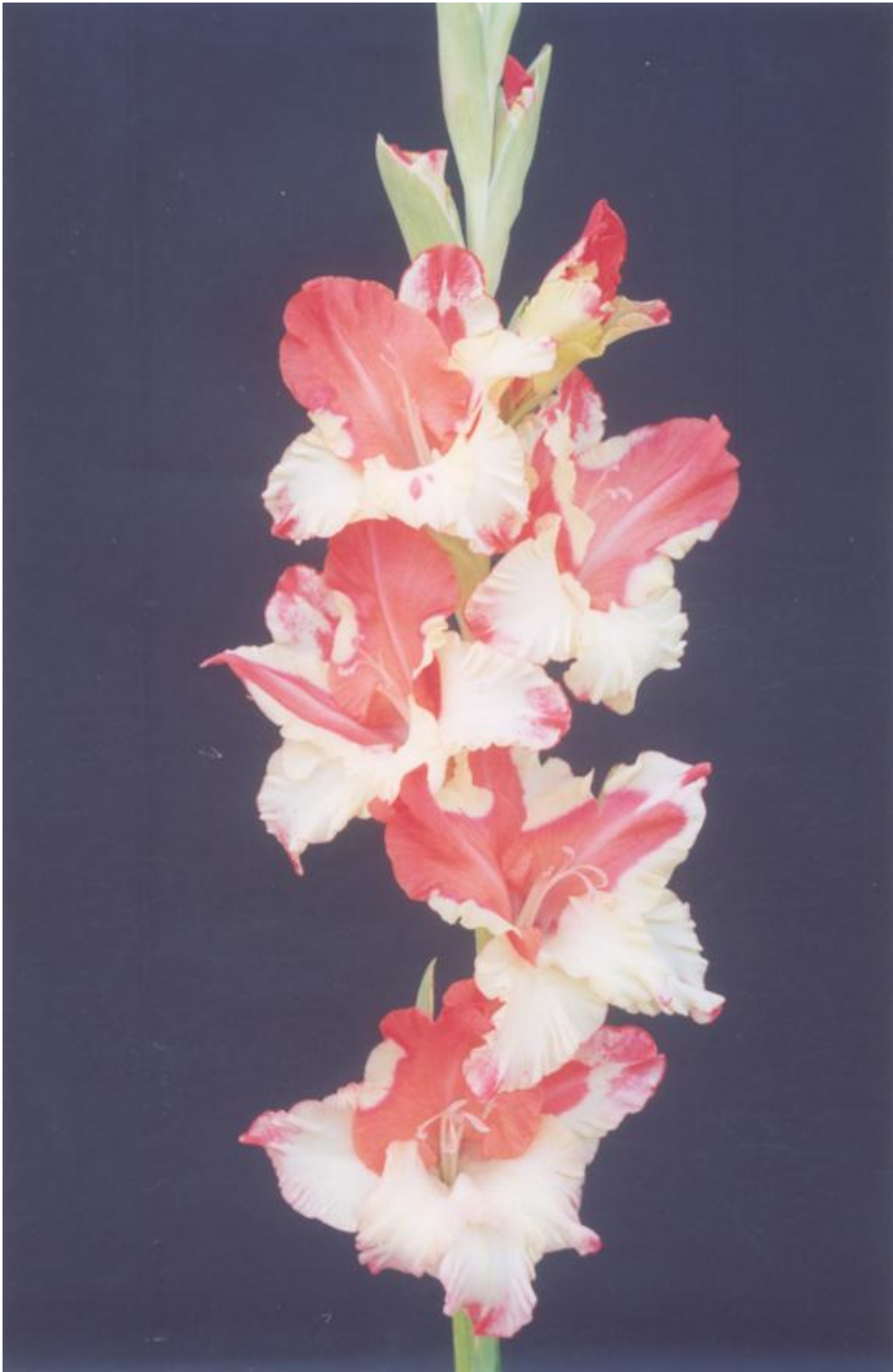
57. 553 "Fenomen". Murin. Medium. Brand-new. Is distinguished by large white spot perfectly matching light red colour, very dense texture, grows and reproduces well