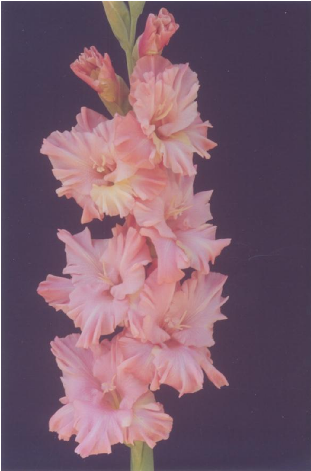
32. 544 "Knyajna". Murin. Medium. Brand-new. Is distinguished by unusual rosy colour, accurate architecture of flower, big flower of 15 cm in diameter