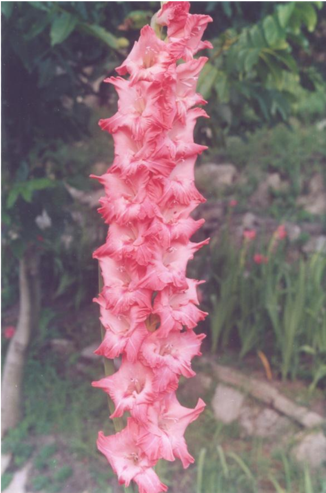
29. 444 "Rozovy Eshelon". Murin. Medium. Brand-new. Flowers simultaneously up to 20 flowers, big flower, well reproducing, created from famous sort "Echelon"