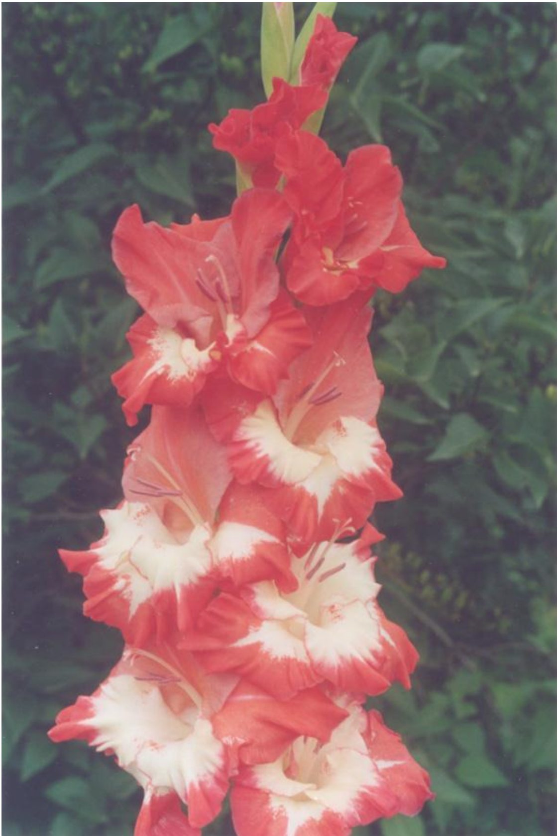
21. 553 "Madam". Murin. Medium. Brand-new. Is distinguished by large white spot and intense growth