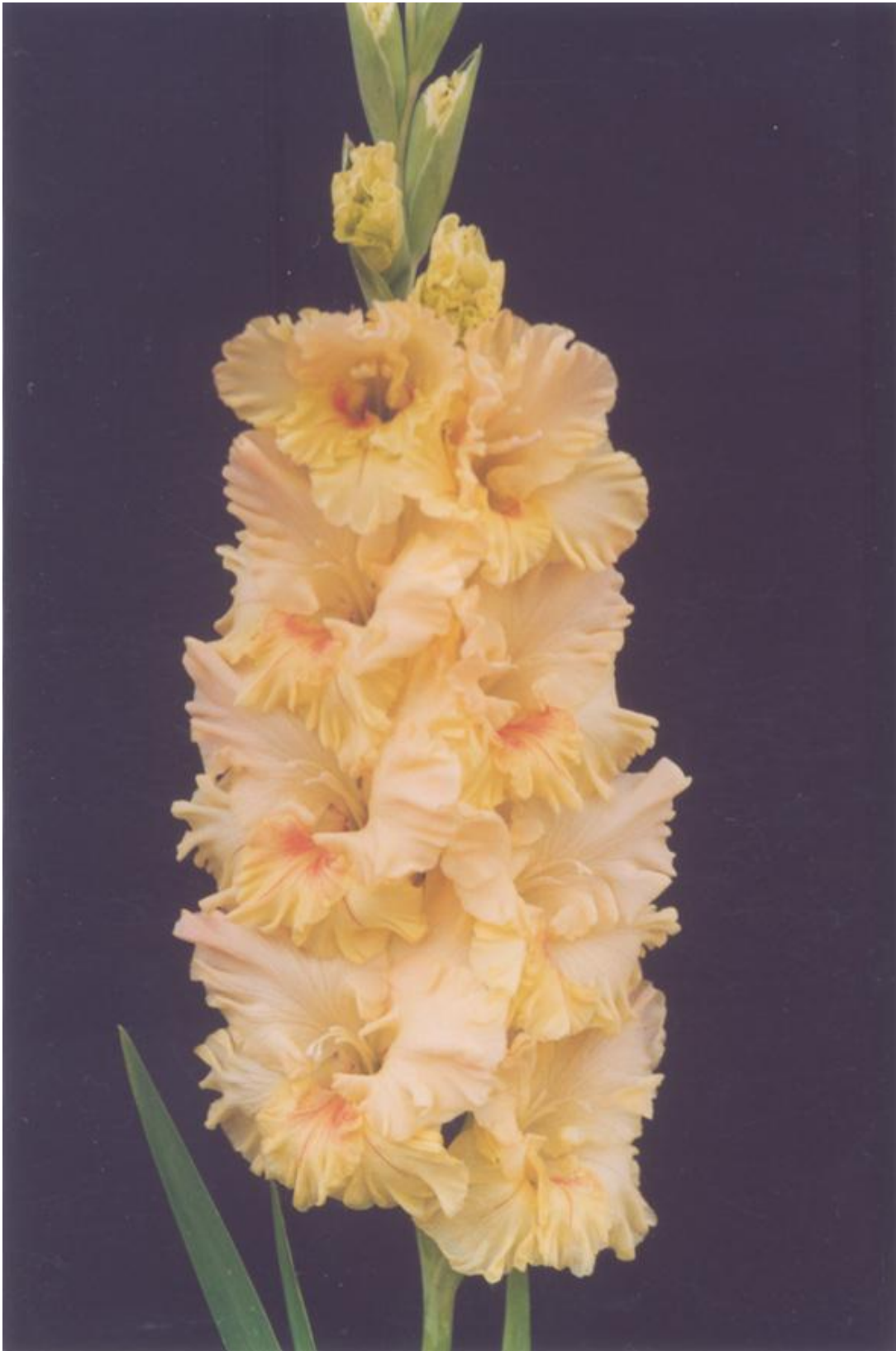
44. 515 "Vakhanka". Murin. Medium. Brand-new. Good flowers' arrangement, dense ear, beautiful kilting