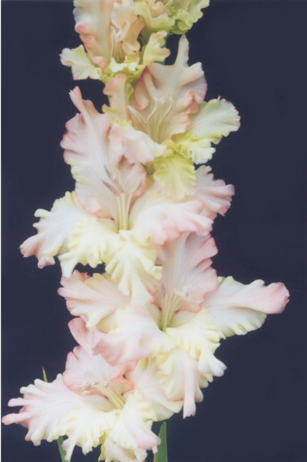
94. 541 "PaDede". Murin. Medium. Brand-new. Rosy, cream and green colour tones make pleasant impression, strongly kilted, original form of the flower