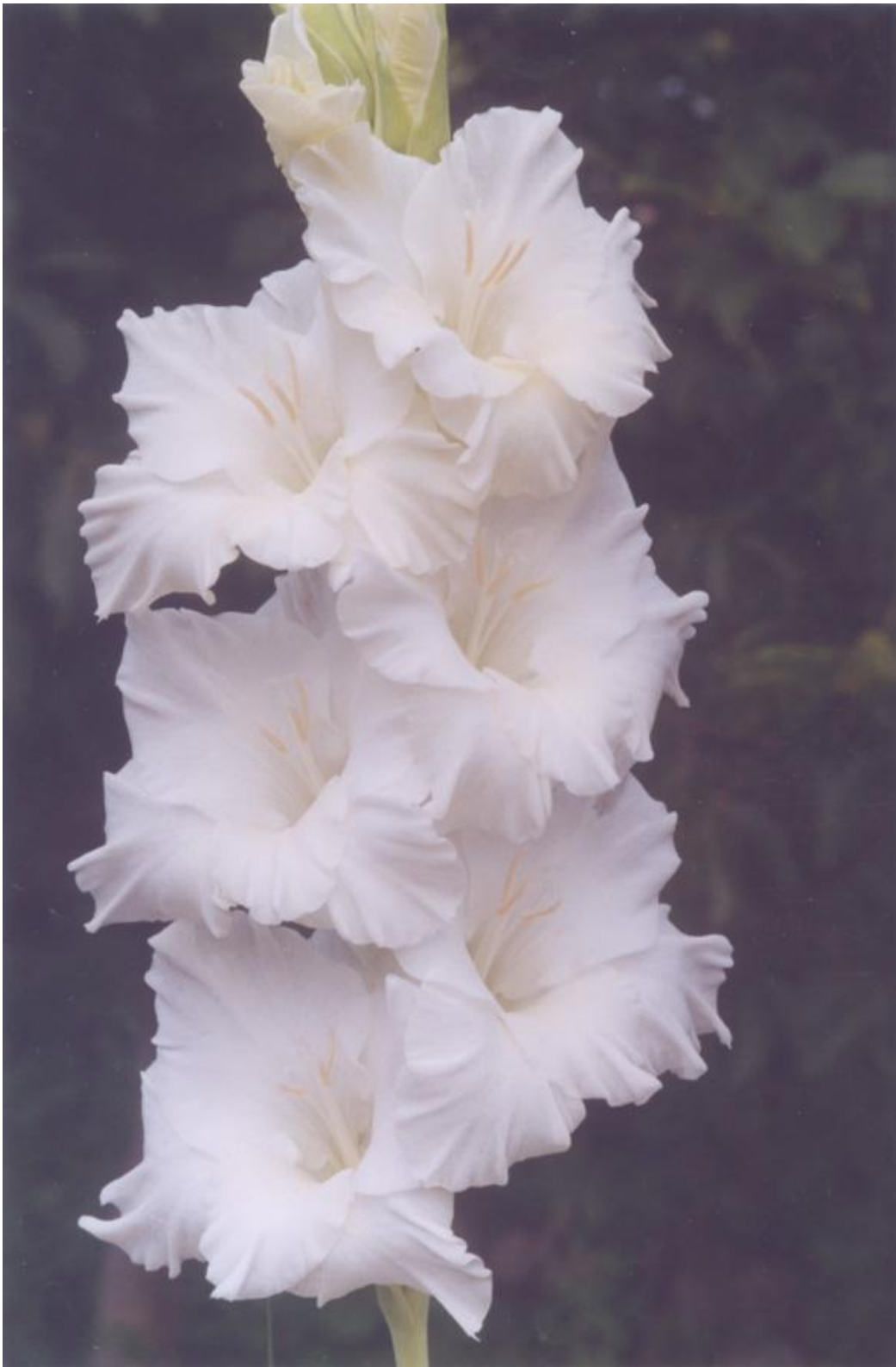
4. 500 "Sibyri". Murin. Medium. Brand-new. Is distinguished by very big flowers up to 18 cm in diameter, strong