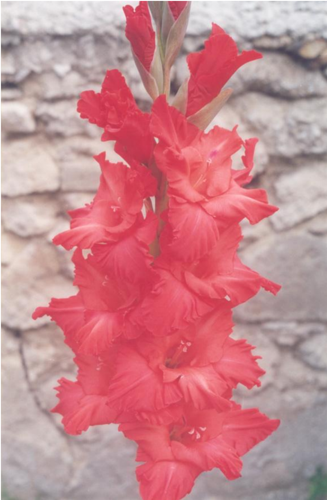
45. 554 "Kozyrny Tuz". Murin. Medium. Brand-new. Big flower of up to 20 cm in diameter, dense texture, beautiful kilting and long up to 1 m ear