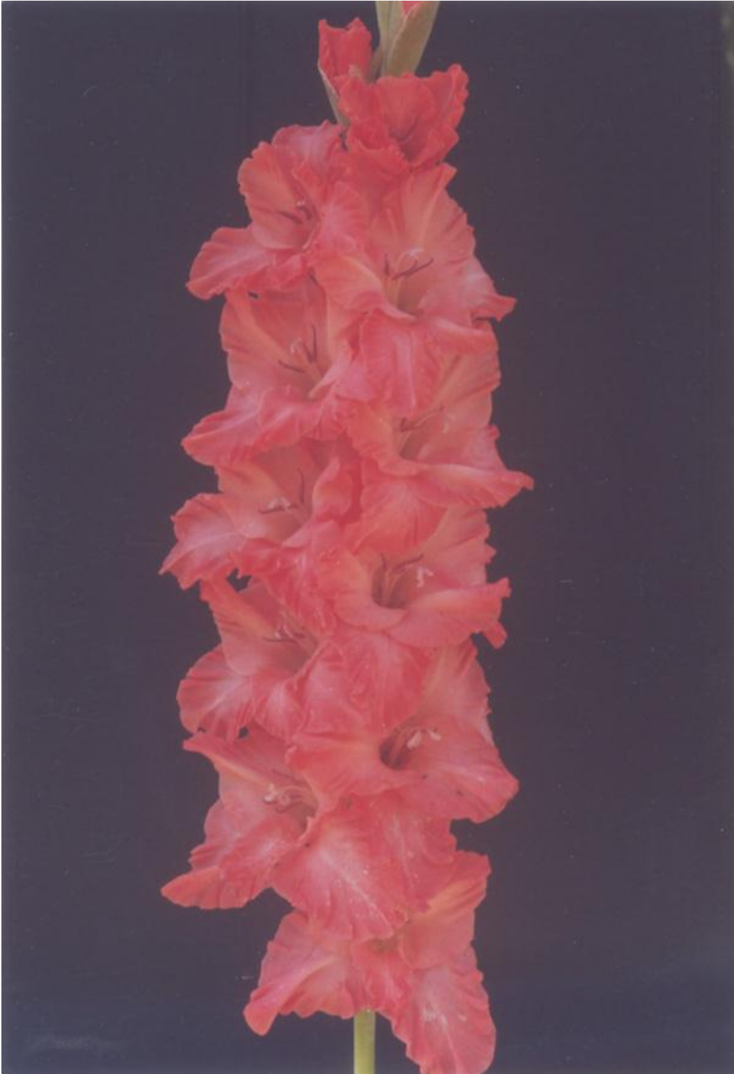
6. 536 "Mir Prekrasen". Murin. Medium. Brand-new. Opens simultaneously up to 14 flowers which have 16 cm in diameter, strong