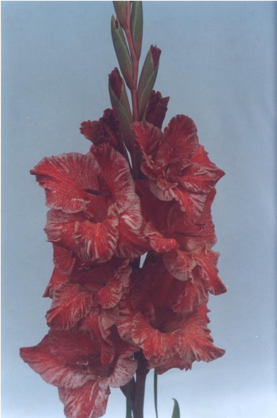
100. 557 "Calambur". Murin. Medium. Brand-new. Is distinguished by beautiful moire pattern on dark-red background