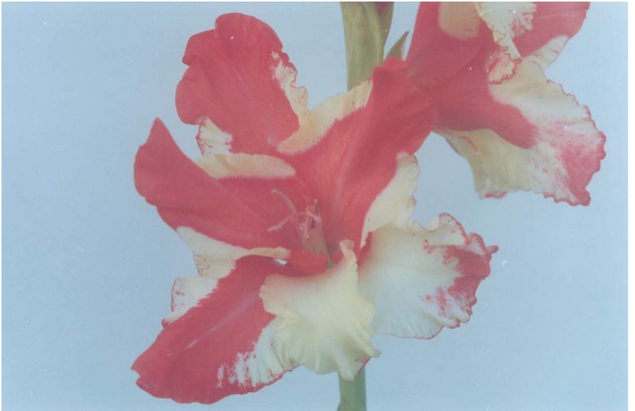
41. 553 "Fantom". Murin. Medium. Brand-new. Is distinguished by original spot