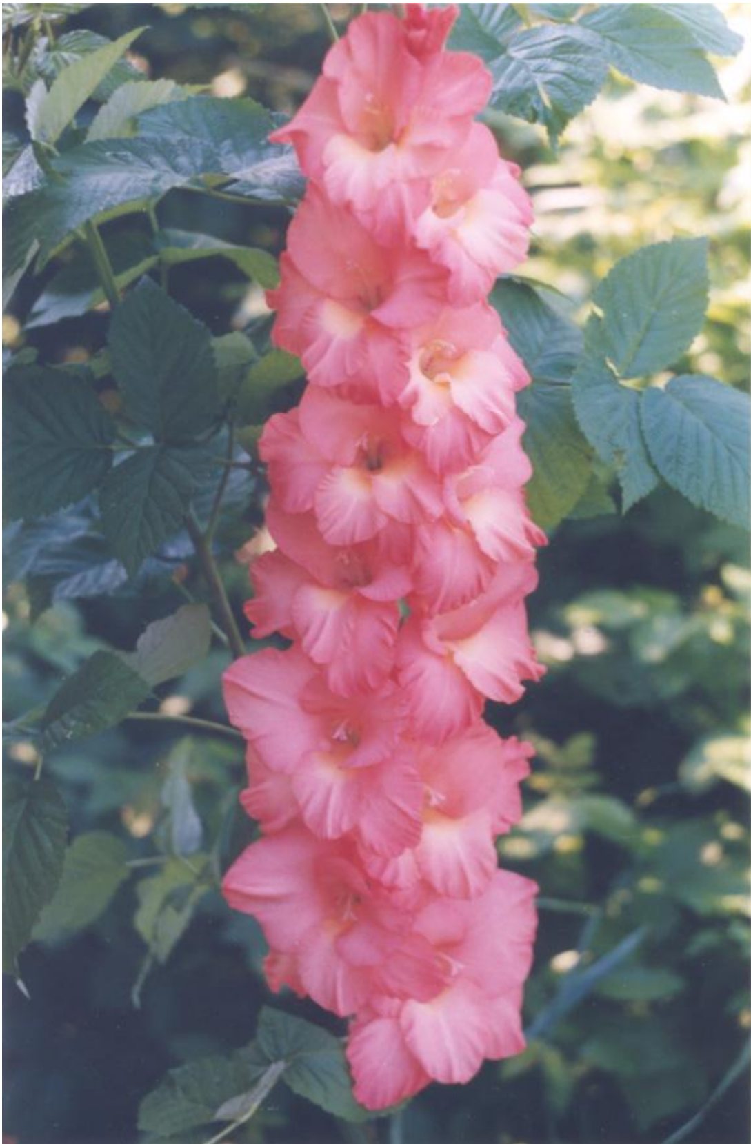
19. 535 "Marget". Murin. Medium. Brand-new. Is distinguished by strong inflorescence, very big flower of up to 17 cm in diameter and good growth