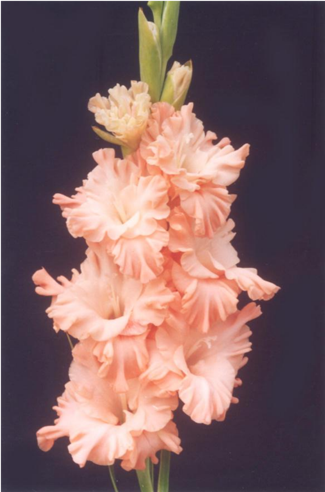
104. 543 "Secret". Murin. Medium. Brand-new. Very strong kilted, dense texture in combination with lightness and tenderness of colour favorably distinguishes this sort from others