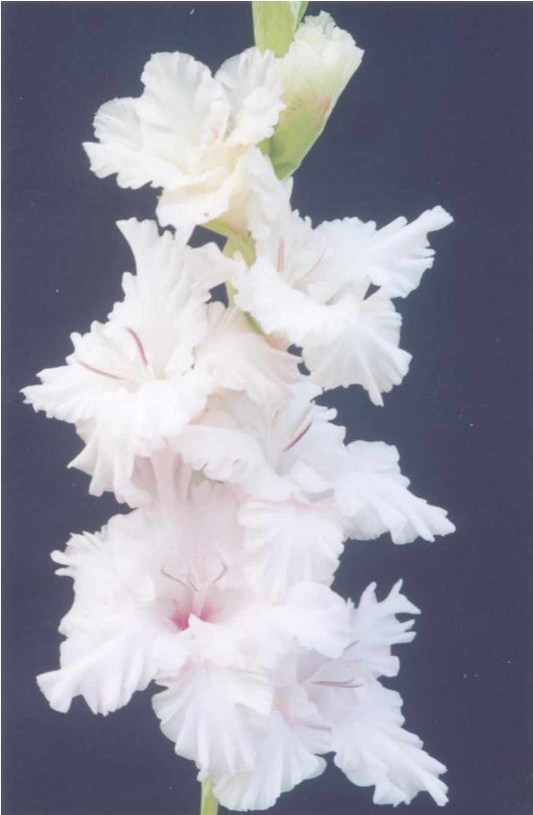
59. 500 "Sibyri Matushka". Murin. Medium. Brand-new. Is distinguished by very big flower of up to 18 cm, nice kilting, intense growth