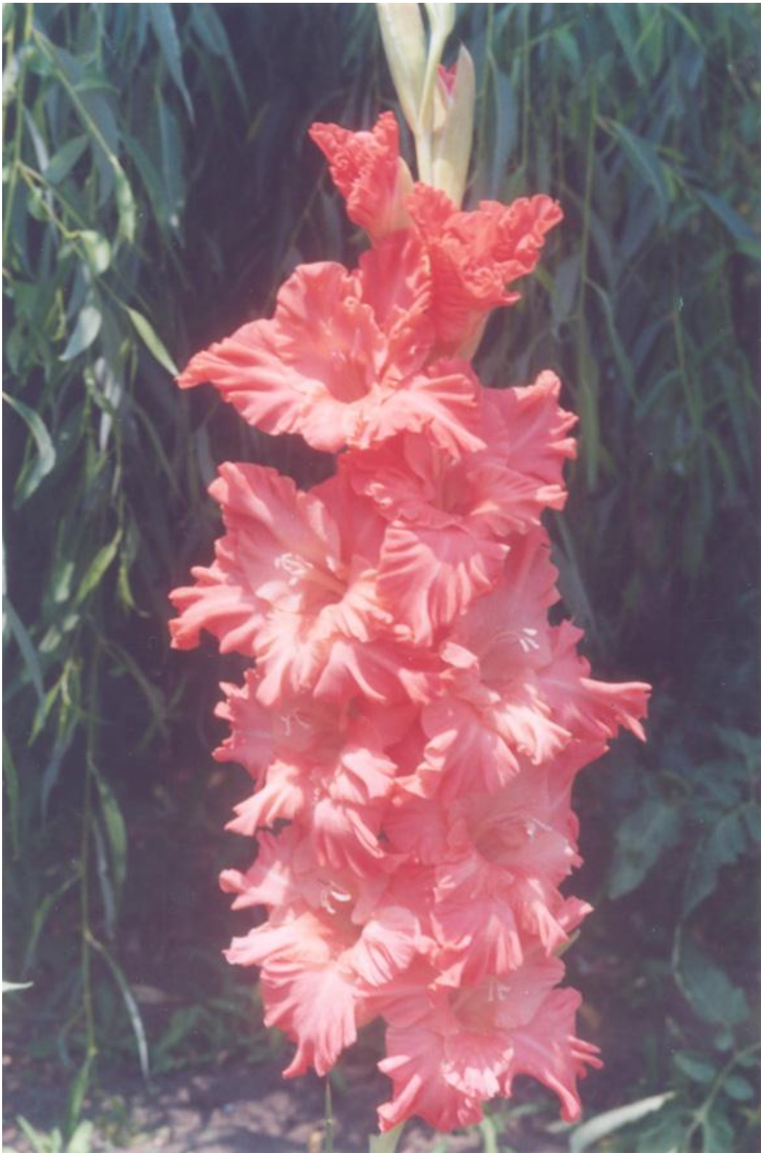
15. 544 "Maria Bieshu". Murin. Medium. Brand-new. Big flowers, beautiful kilting, bright.