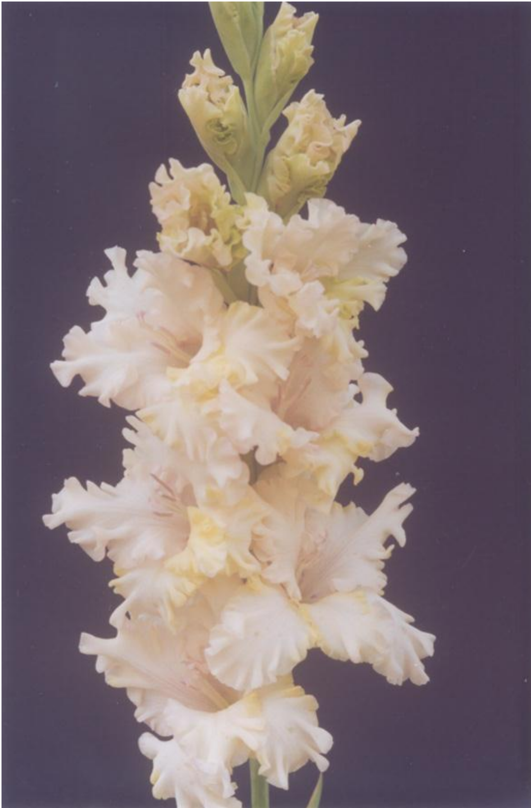
37. 511 "Vesyoloye Nastroyenye". Murin. Medium. Brand-new. Superkilted with yellow strokes