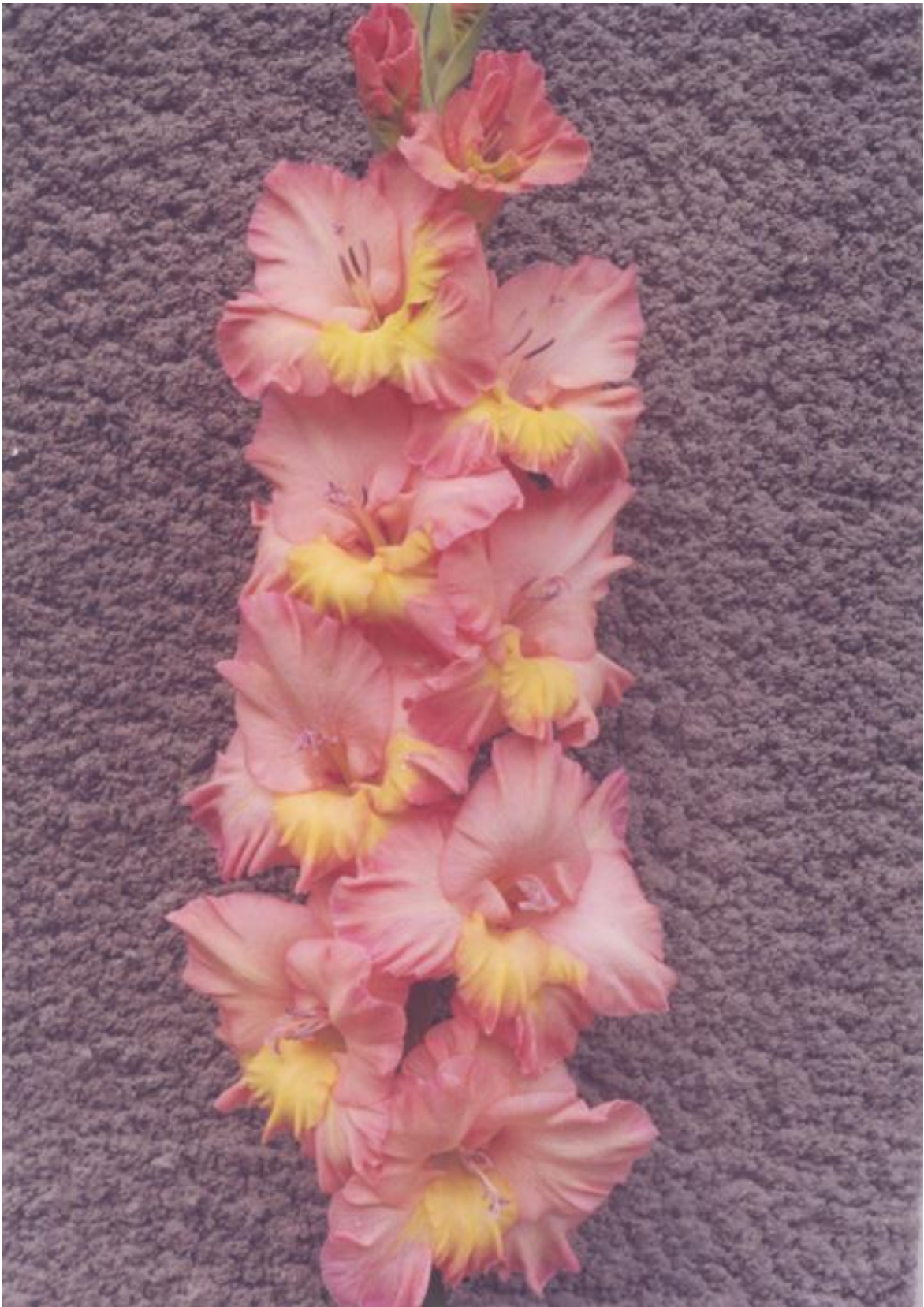
18. 593 "Boginea Canon". Murin. Medium. Brand-new. Is distinguished by smoky-rosy colour, original yellow spot and early flowering