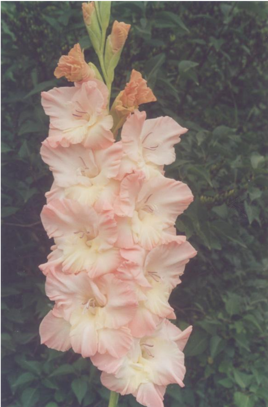
22. 541 "Liogky Briz". Murin. Medium. Brand-new. Is distinguished by freshness and flat flower, makes good impression