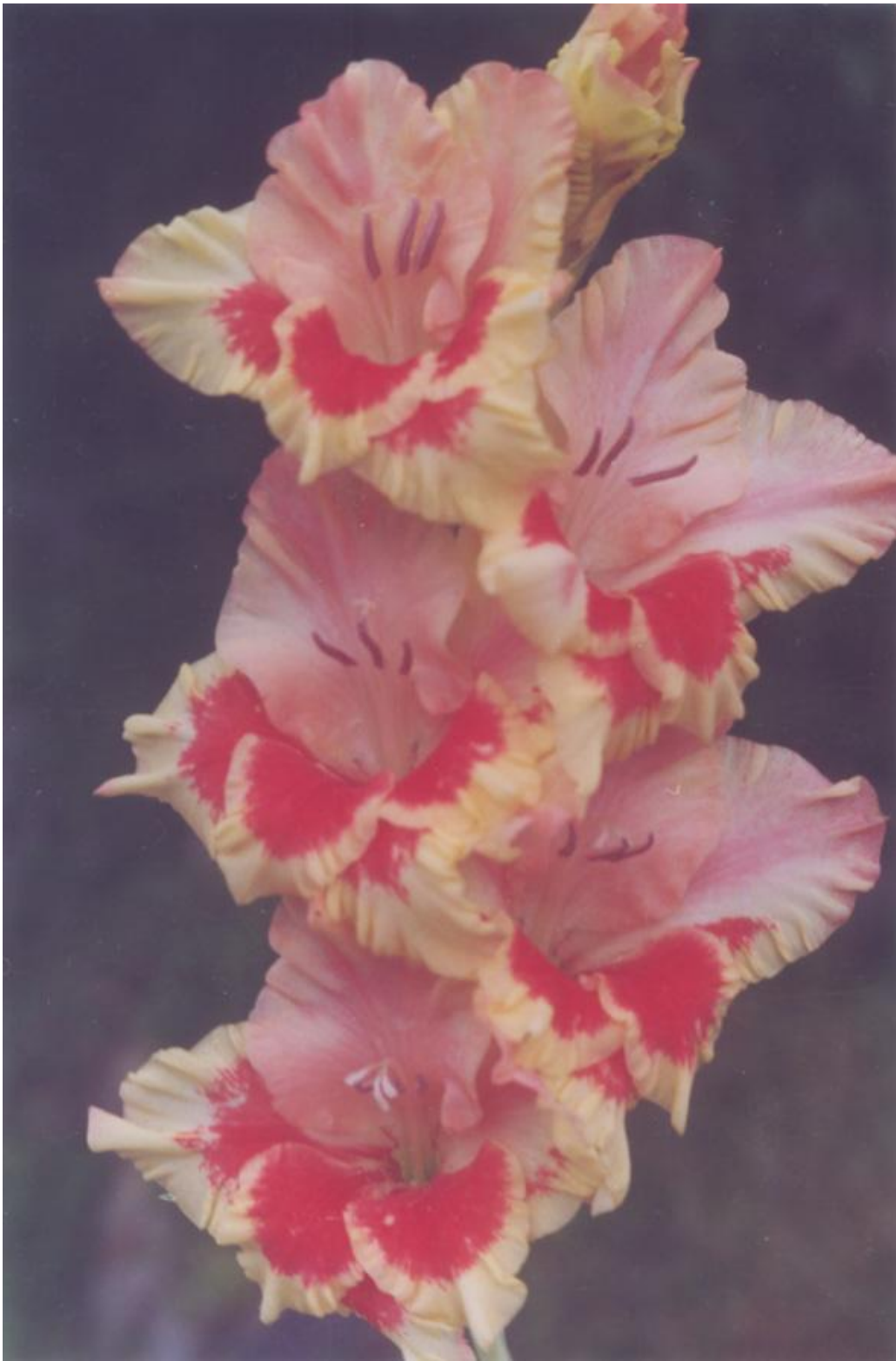
12. 513 "Maska". Murin. Medium. Brand-new. Is distinguished by original three colours and big flower