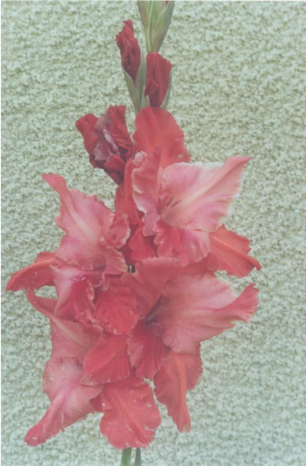
27. 553 "Superbicolor". Murin. Medium. Brand-new. Outer petals are red, inner – lilac-rosy, very big flower of up to 17 cm