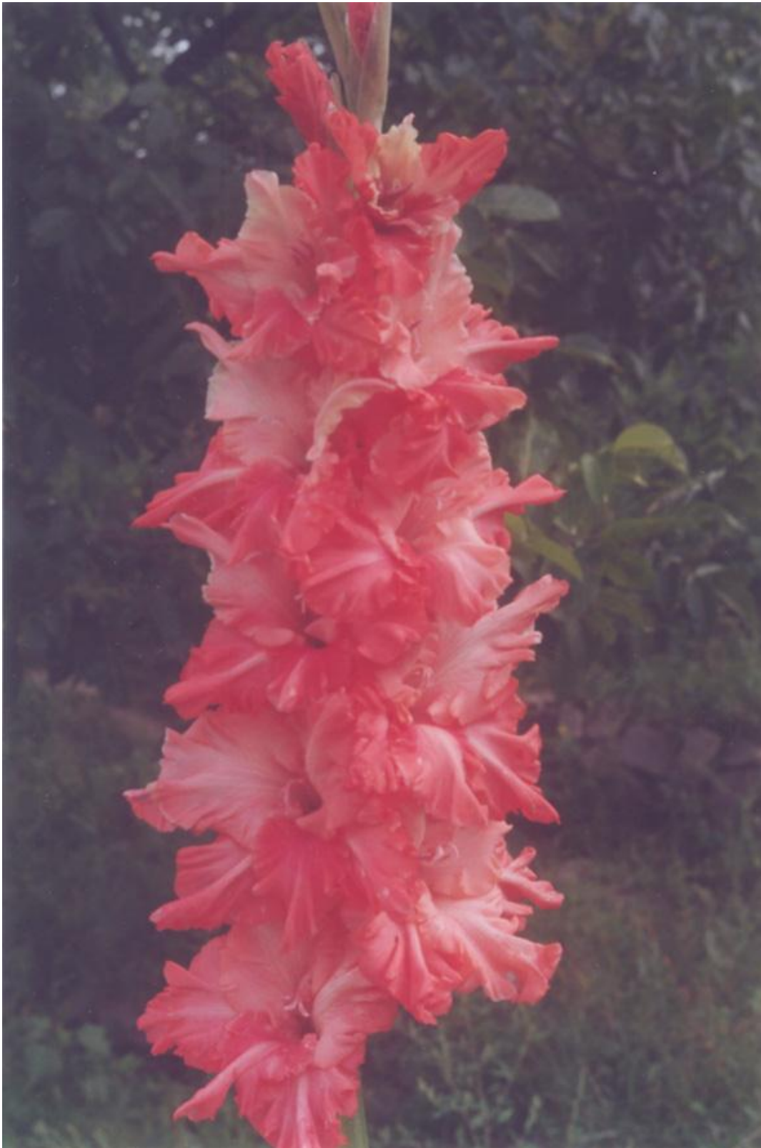
38. 553 "Talisman". Murin. Medium. Brand-new. Is distinguished by strong inflorescence, beautiful flower arrangement, flowers up to 12 flowers