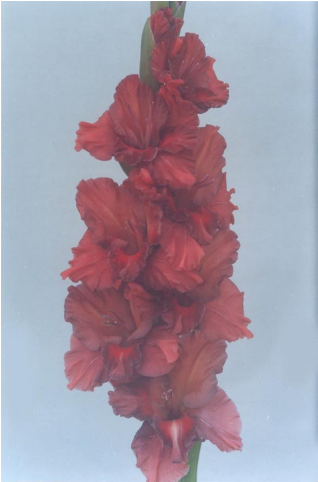
101. 495 "Sard". Murin. Medium. Brand-new. Is distinguished by hazy brown colour with red spots