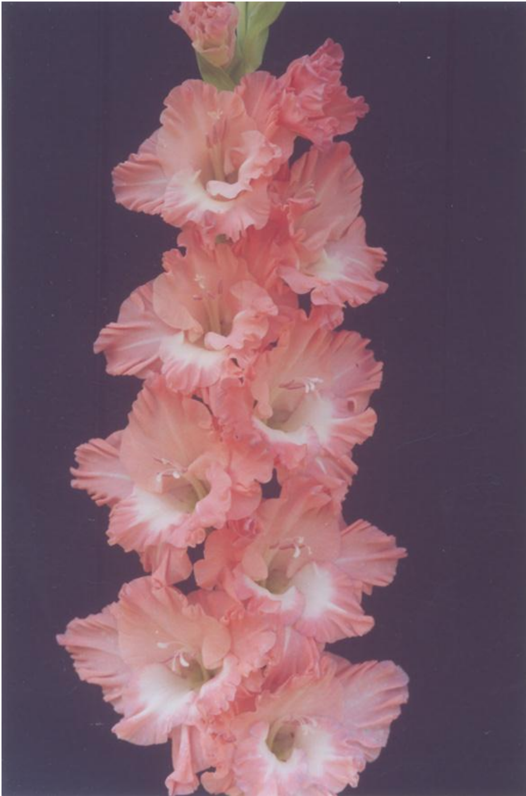
40. 545 "Podarok". Murin. Medium. Brand-new. Big flower, dense texture, beautiful kiltig