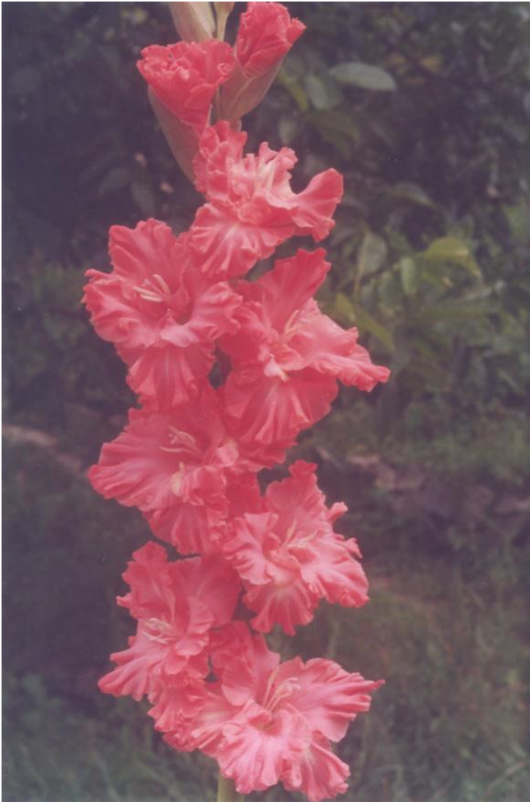
39. 544 "Pervaya Ledi". Murin. Medium. Brand-new. Is distinguished by very dense texture of petals, very strong kilting and light salmon-rosy colour (Pinc)