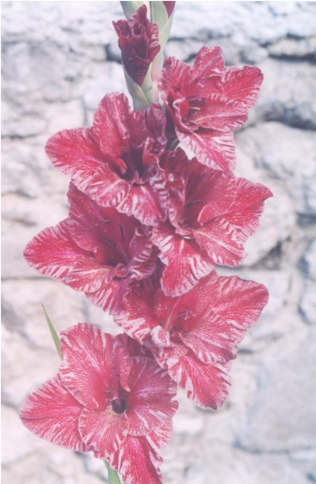
47. 555 "Krasny Muar". Murin. Medium. Brand-new. Original moire, beautiful kilting, dense texture