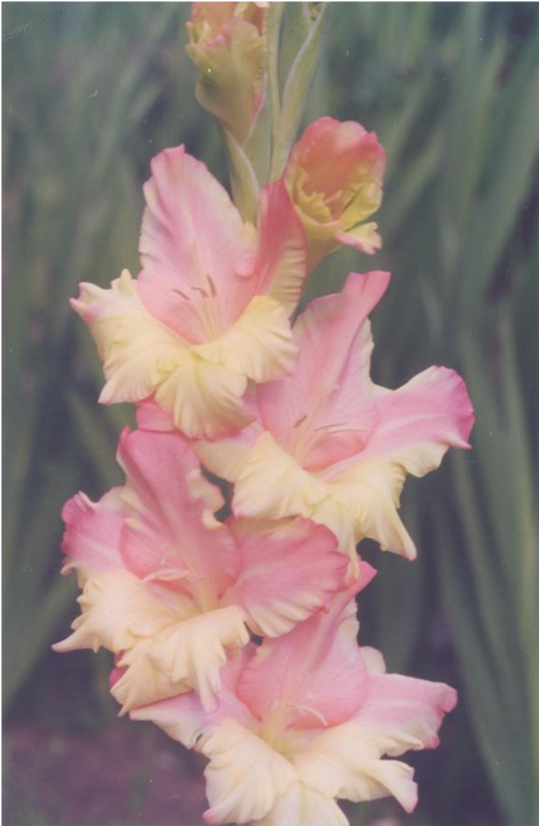
46. 543 "Selena". Murin. Medium. Brand-new. Is distinguished by big cream-light-green spot nicely matching with rosy colour of petal