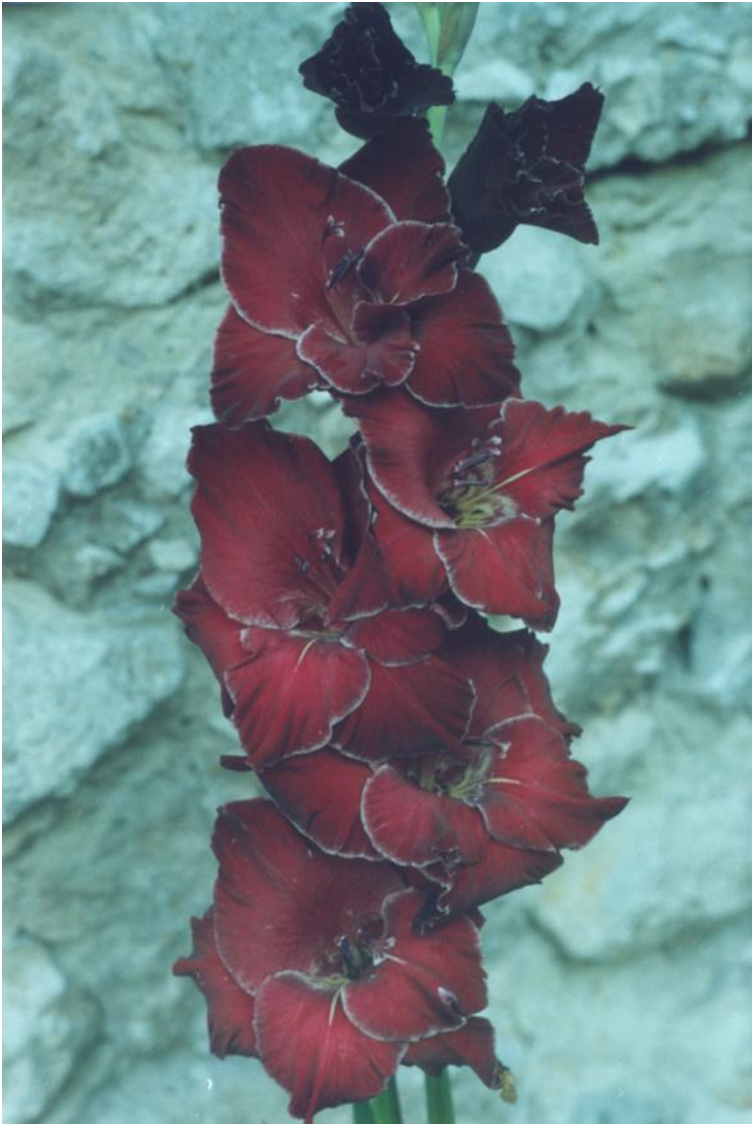
96. 559 "Romen". Murin. Medium. Brand-new. Is distinguished by beautiful edge in dark-red sort, dense texture of petals and intense growth