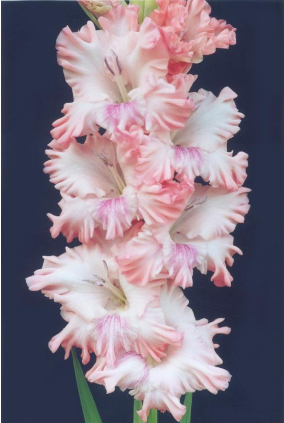
95. 543 "Capriz". Murin. Medium. Brand-new. White with rosy edges, lilac radiant spot with the kilting on petals' edges and dense texture