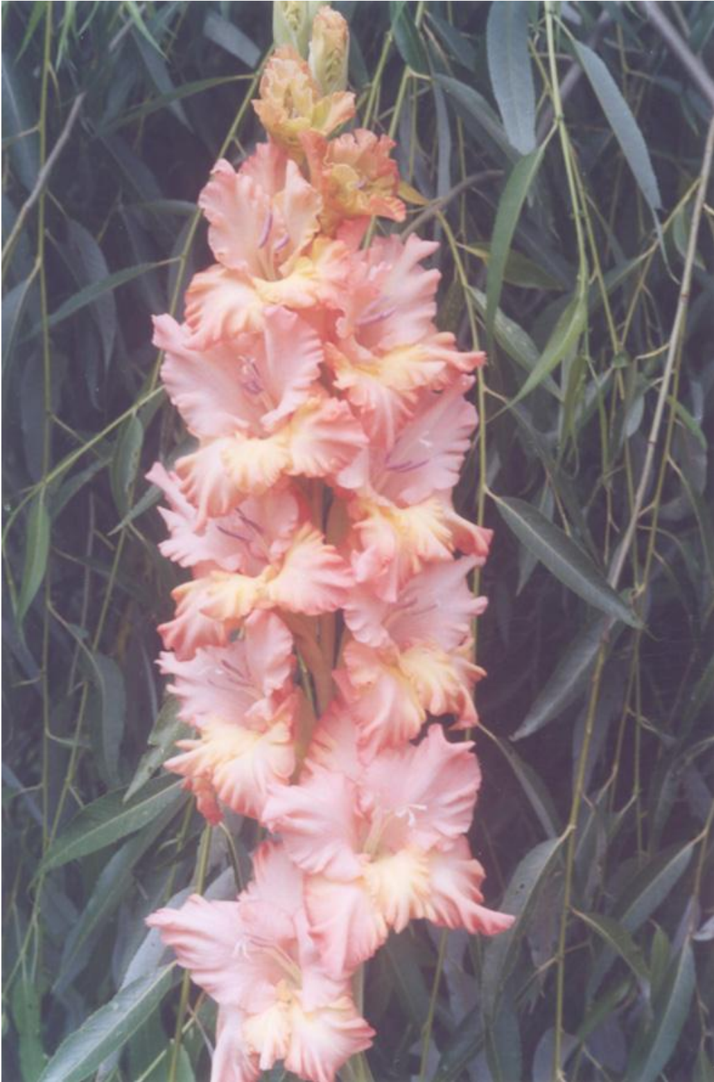
13. 543 "Vysota". Murin. Medium. Brand-new. Very long, strong, flowers 12 flowers