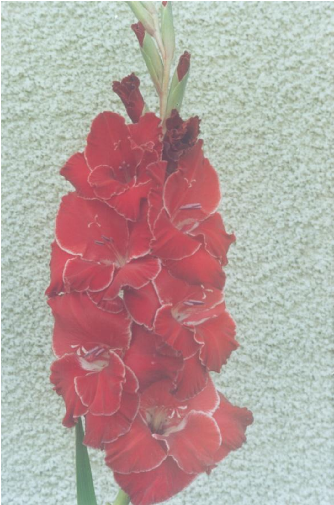
25. 557 "Vnuk Ventsa". Murin. Medium. Brand-new. Is distinguished by beautiful edges inherited from sort "Crown" and nice dark red colour, very big