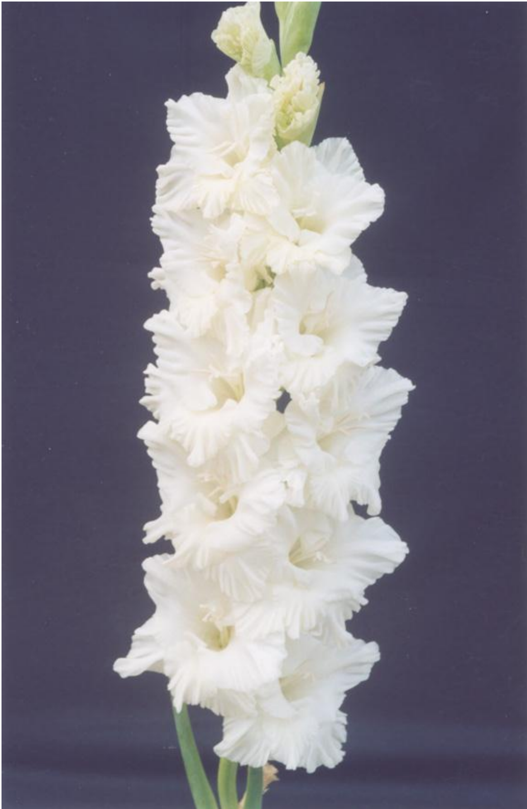
51. 500 "Sniejny Vyhri". Murin. Medium. Brand-new. Flowers up to 14 flowers, beautiful, thick ear, nice kilting, flower is 15 cm in diameter